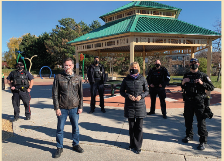
Halton Regional Police provide patrol update