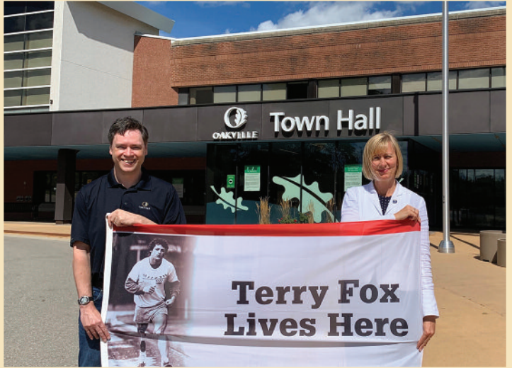
Terry Fox flag raising