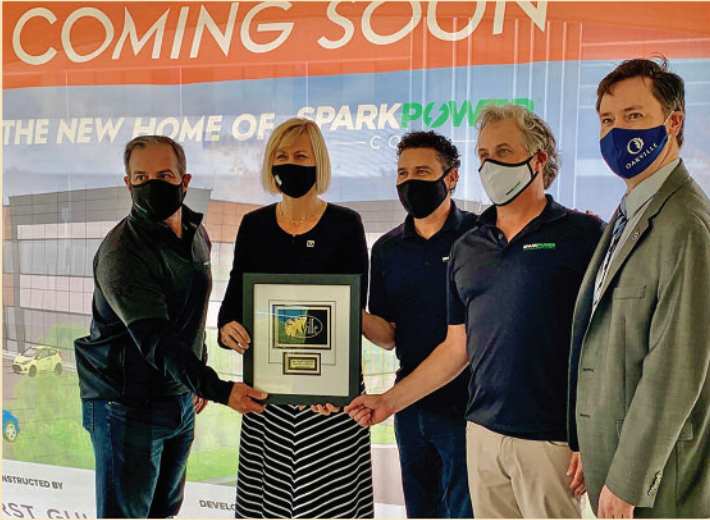
Groundbreaking of new SparkPower office in Ward 6