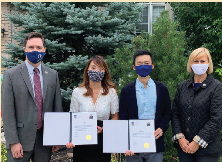
Ward 6 residents thanked for their PPE donations to support the Oakville community