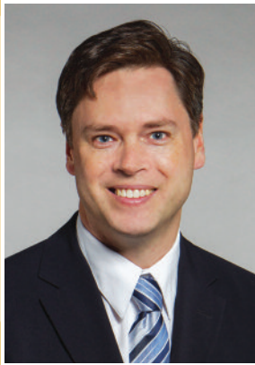
Regional and Town Councillor - Ward 6