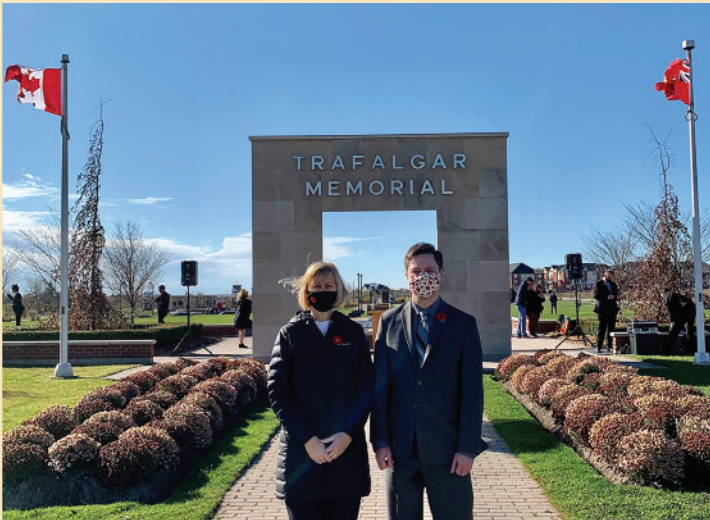
Remembrance Day at Trafalgar Memorial