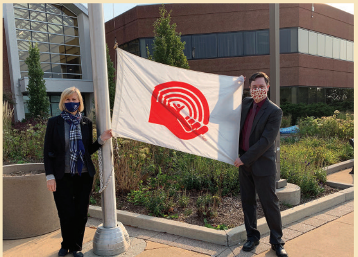
United Way flag raising at Town Hall