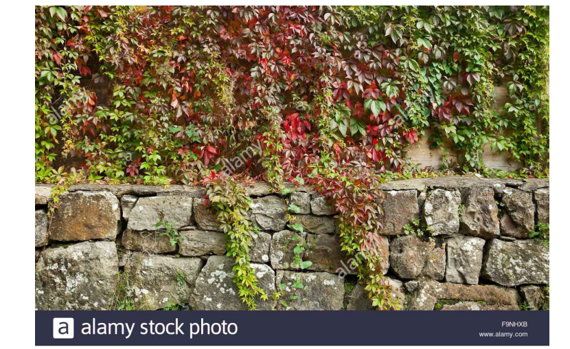
Example of vines covering retaining wall

218 Locke Street South, 2nd Floor Hamilton, ON L8P 4B4 1.905.526.8876 www.adessodesigninc.ca