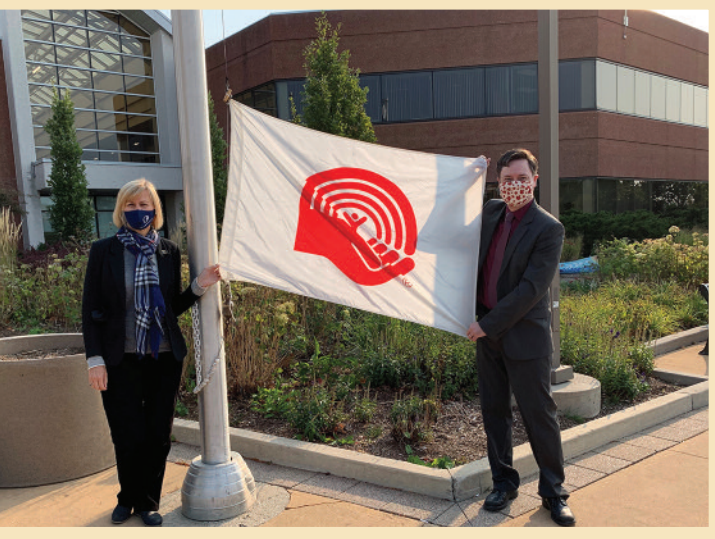
United Way flag raising at Town Hall