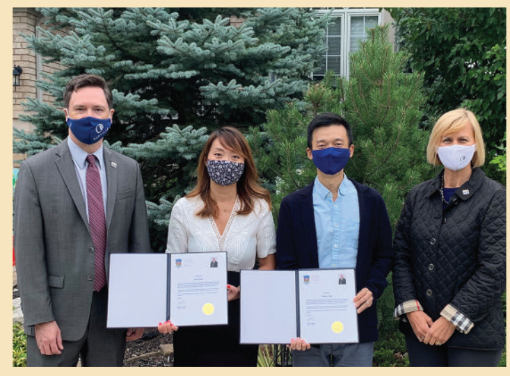
Ward 6 residents thanked for their PPE donations to support the Oakville community