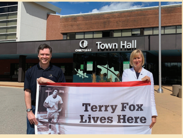
Terry Fox flag raising