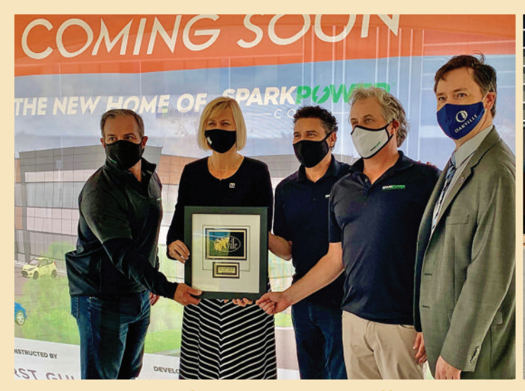
Groundbreaking of new SparkPower office in Ward 6