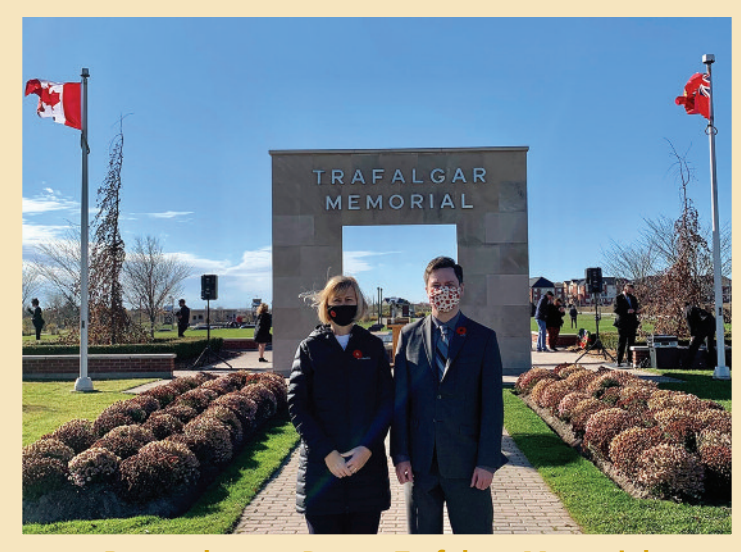
Remembrance Day at Trafalgar Memorial