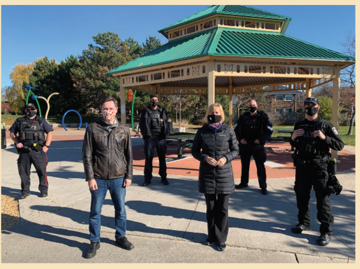
Halton Regional Police provide patrol update