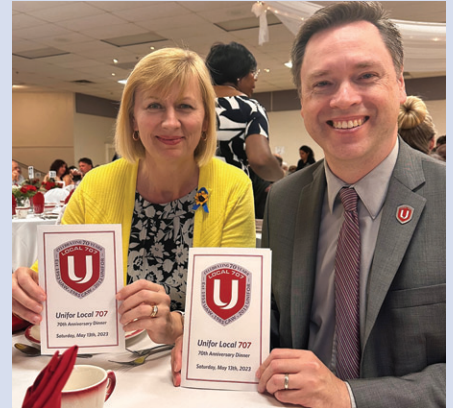
Unifor Local 707 70th Anniversary