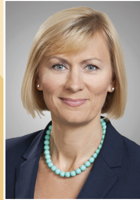
Town Councillor - Ward 6

Council continues to build and maintain infrastructure that improves the livability of our communities. In addition to road improvements, we are also improving walking, cycling and public transit infrastructure.