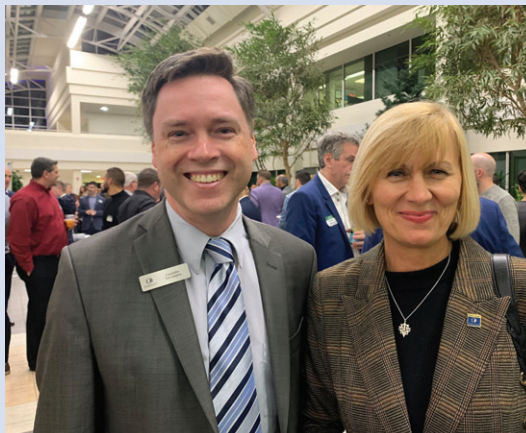
Hosting Oakville Chamber of Commerce Business After Hours at Town Hall