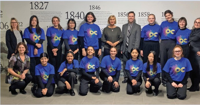
New Year's Levee at Town Hall