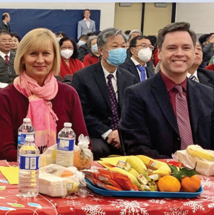
Celebrating Chinese New Year with the Oakville Jiu-Jiu Seniors Association