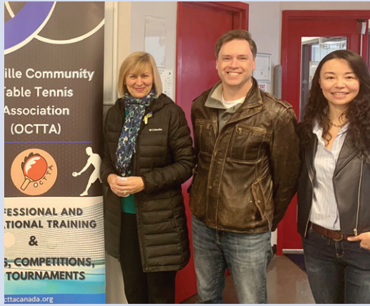
Recognizing Oakville Community Table Tennis Association Awards