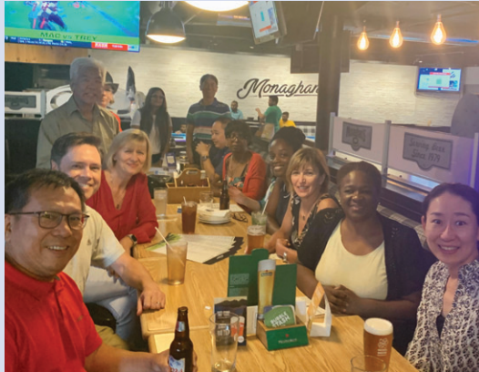
Celebrating with Own the Podium Toastmasters