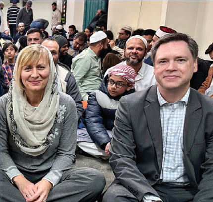
Celebrating Ramadan with World Islamic Mission