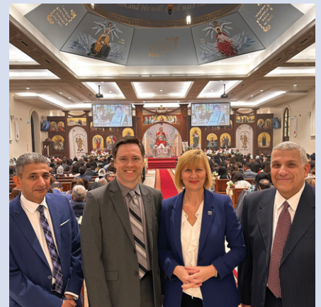
St. Peter and St. Paul Coptic Church Easter celebration