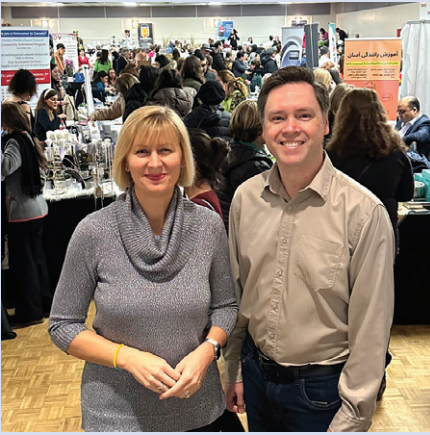
Visiting the Oakville Haftseen Bazaar in Ward 6