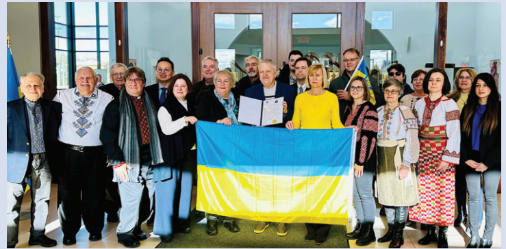
Commemorating the one year anniversary of Russia's war in Ukraine. We stand with Ukraine!