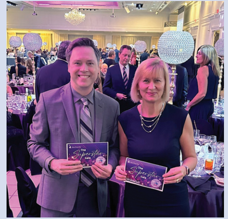
Halton Women's Place Superstar Gala