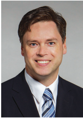
Regional and Town Councillor - Ward 6