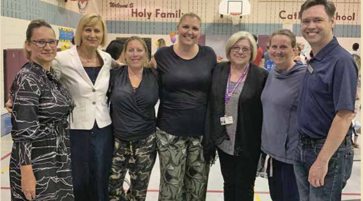
Holy Family Catholic Elementary School Fun Fair