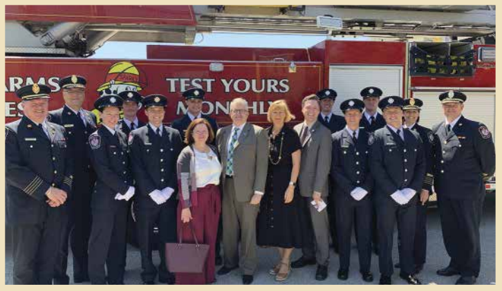
Oakville Fire Graduating Ceremony