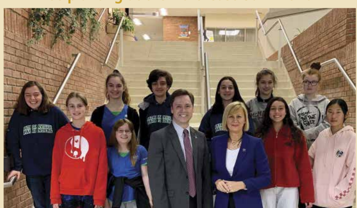
Pathfinders Tour Town Hall

Earth Day Clean Up at St. Simon's Anglican Church