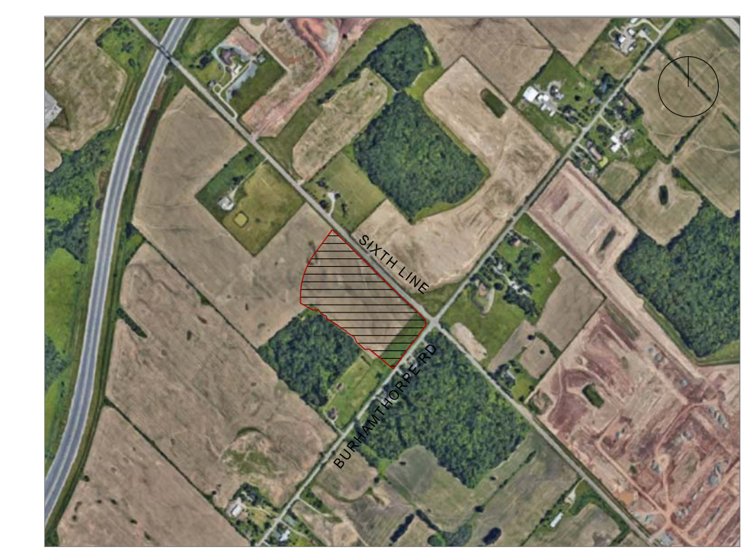
2 AERIAL IMAGE OF SITE A101 NTS