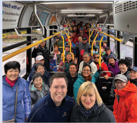
Seniors 99 Tree Planting Day