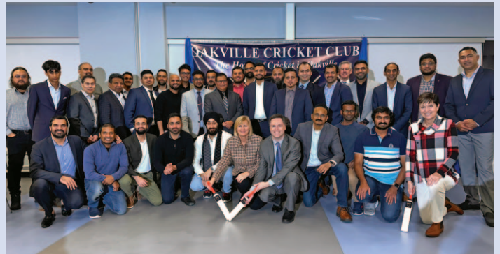
Oakville Cricket Club Awards