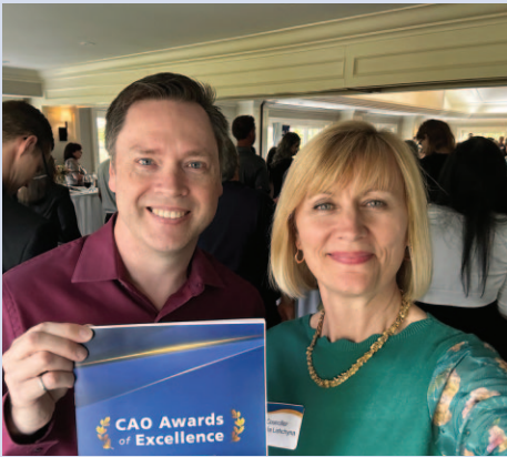
Celebrating Staff Excellence