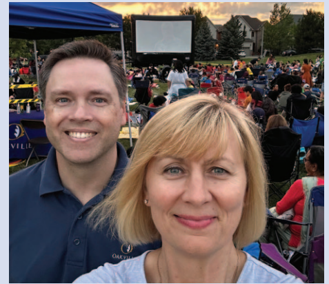
Movies in the Park