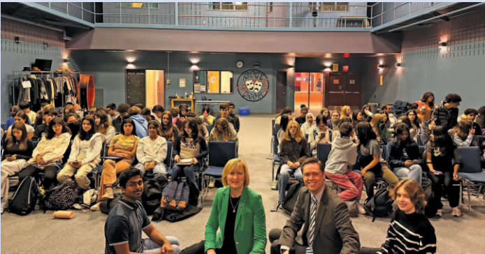
Civics class at Iroquois Ridge High School