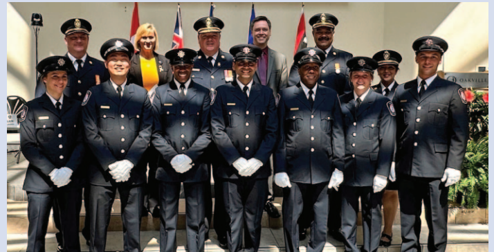
Welcoming New Fire Recruits