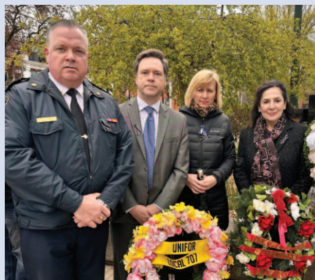
National Day of Mourning