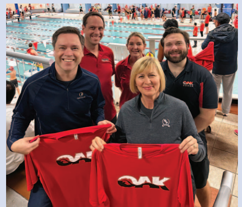
OAK swim meet at Iroquois Ridge Community Centre