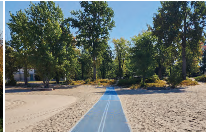
Accessible Sand Mats