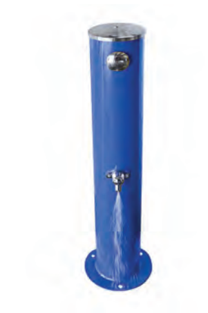
Foot Wash Station