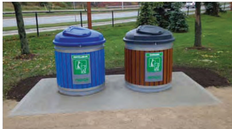
Litter and Recycling Bins