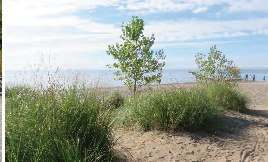
Beach Naturalization Area