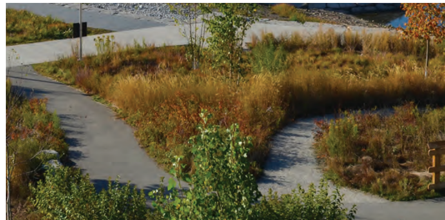
Native Species Planting Area