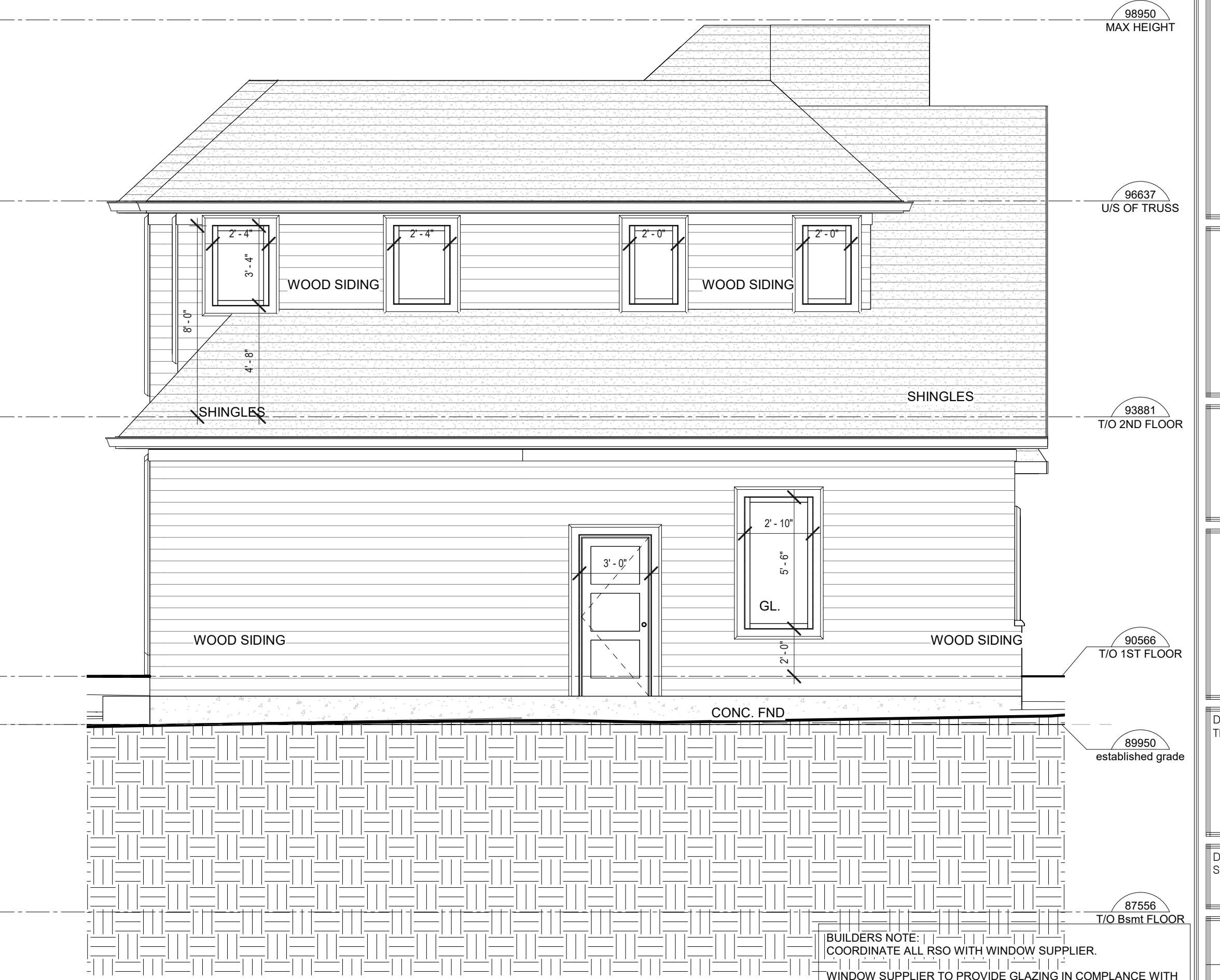
4 EAST ELEVATION 1:50