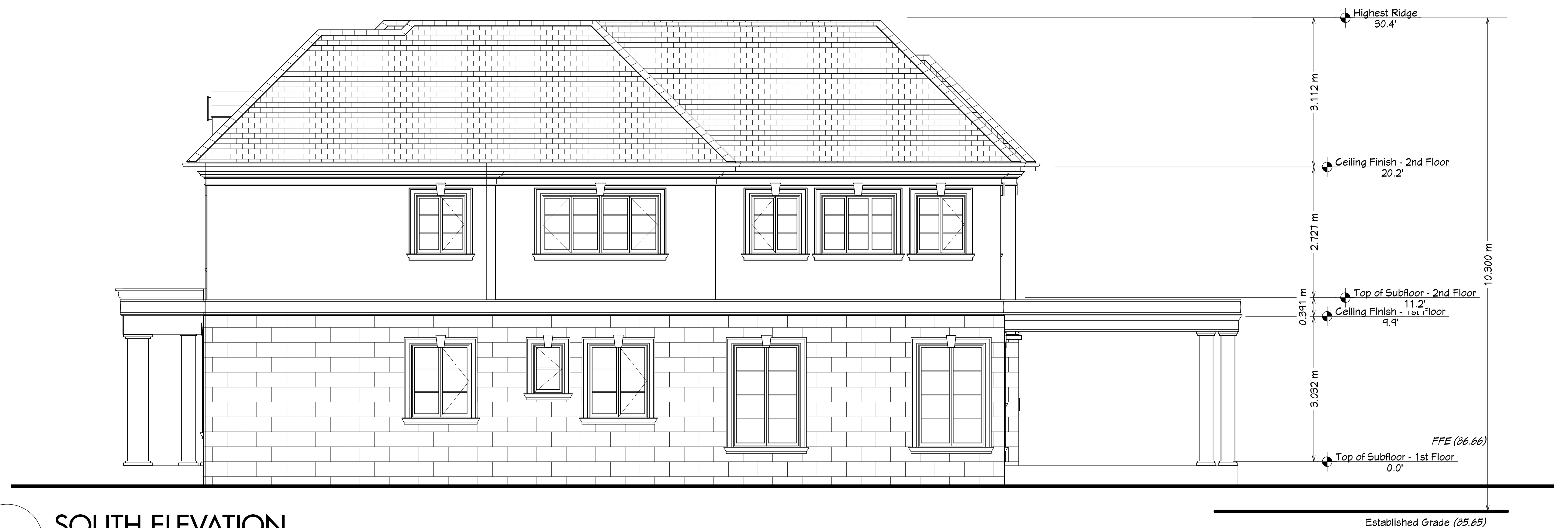
SOUTH ELEVATION 1/4" = 1'-0"

ISSUED FOR SITE PLAN APPLICATION AUG 30 2019