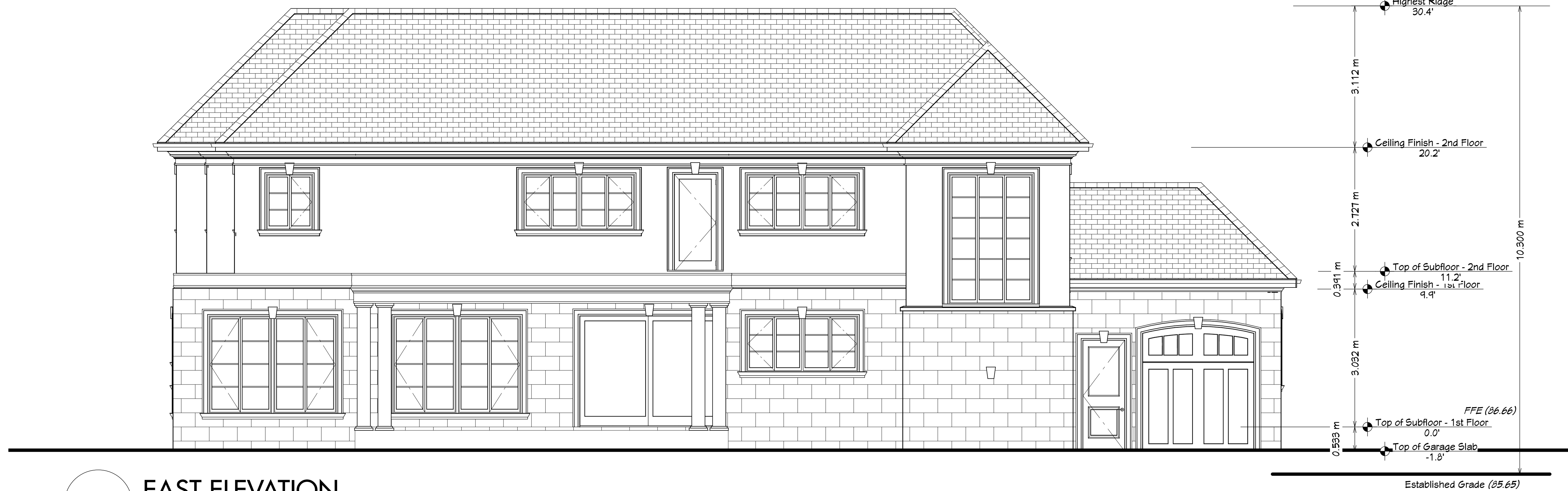
EAST ELEVATION 1/4" = 1'-0"

ISSUED FOR SITE PLAN APPLICATION AUG 30 2019