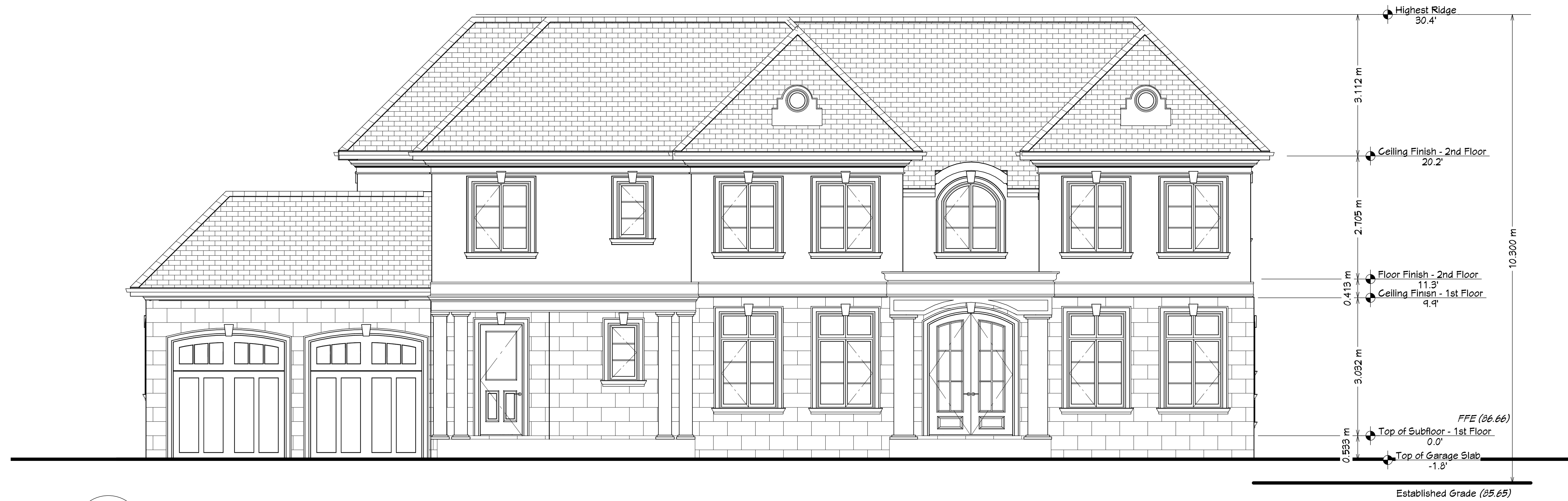
WEST ELEVATION 1/4" = 1'-0"

GENERAL NOTES: These drawings are not to be scaled. All dimensions must be verified by contractor prior to commencement of any work. Any discrepancies must be reported directly to the designer.