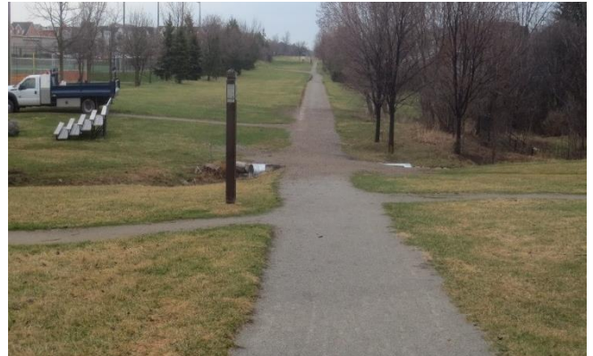
Existing Crosstown Trail – Major Trail