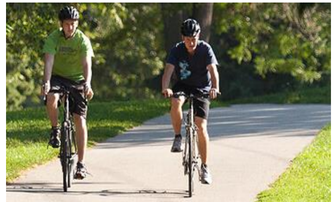
Proposed Crosstown Trail – Future Multi-use Trail