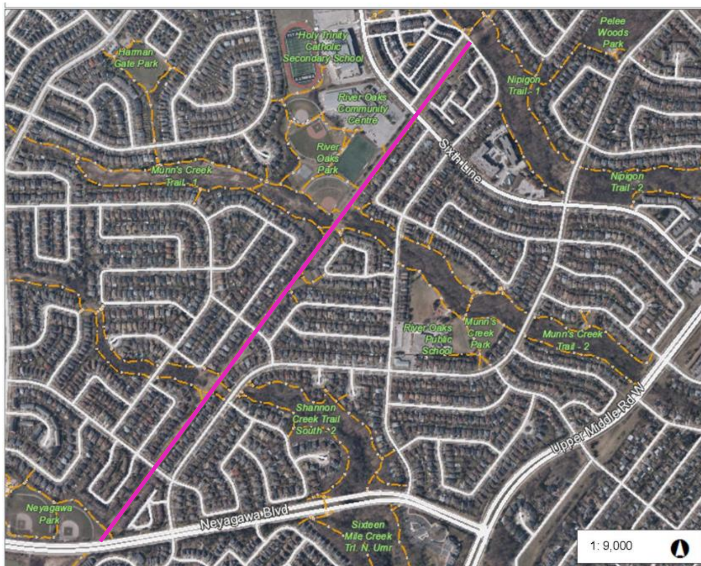
— Proposed Crosstown Trail – Study Area – Section 1 of 2