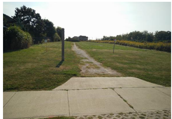
Existing Crosstown Trail – Major Trail