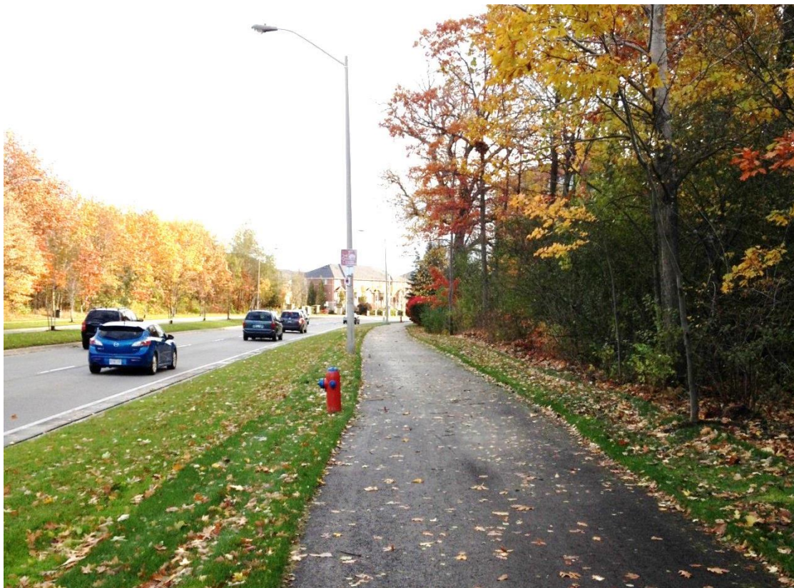
Lakeshore Road – Multi-use Trail example (From Dorval Drive)