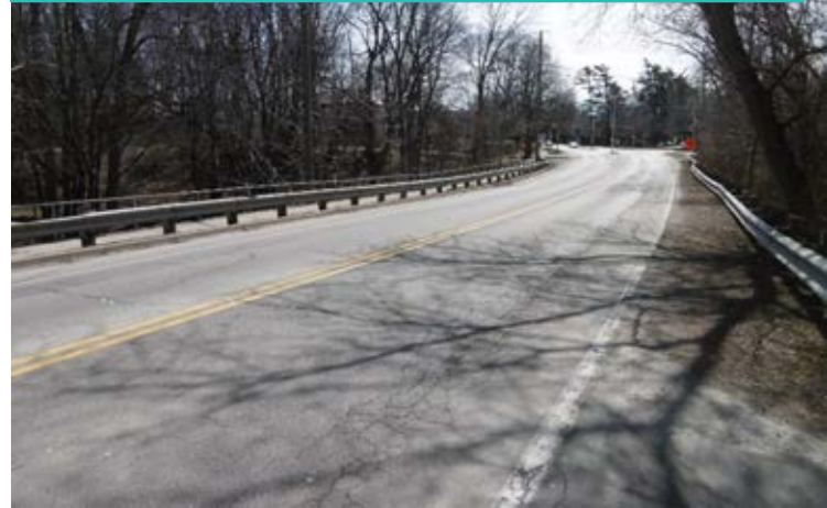
Existing Road Condition