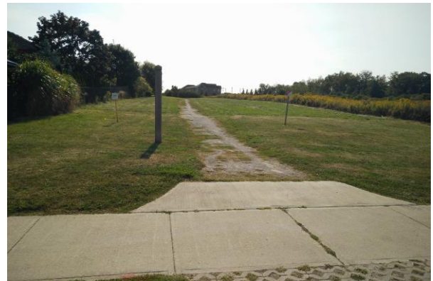
Existing Crosstown Trail – Major Trail