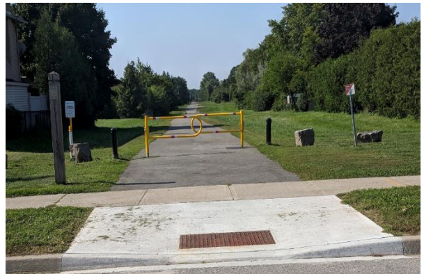
Proposed Crosstown Trail – Future Multi-use Trail