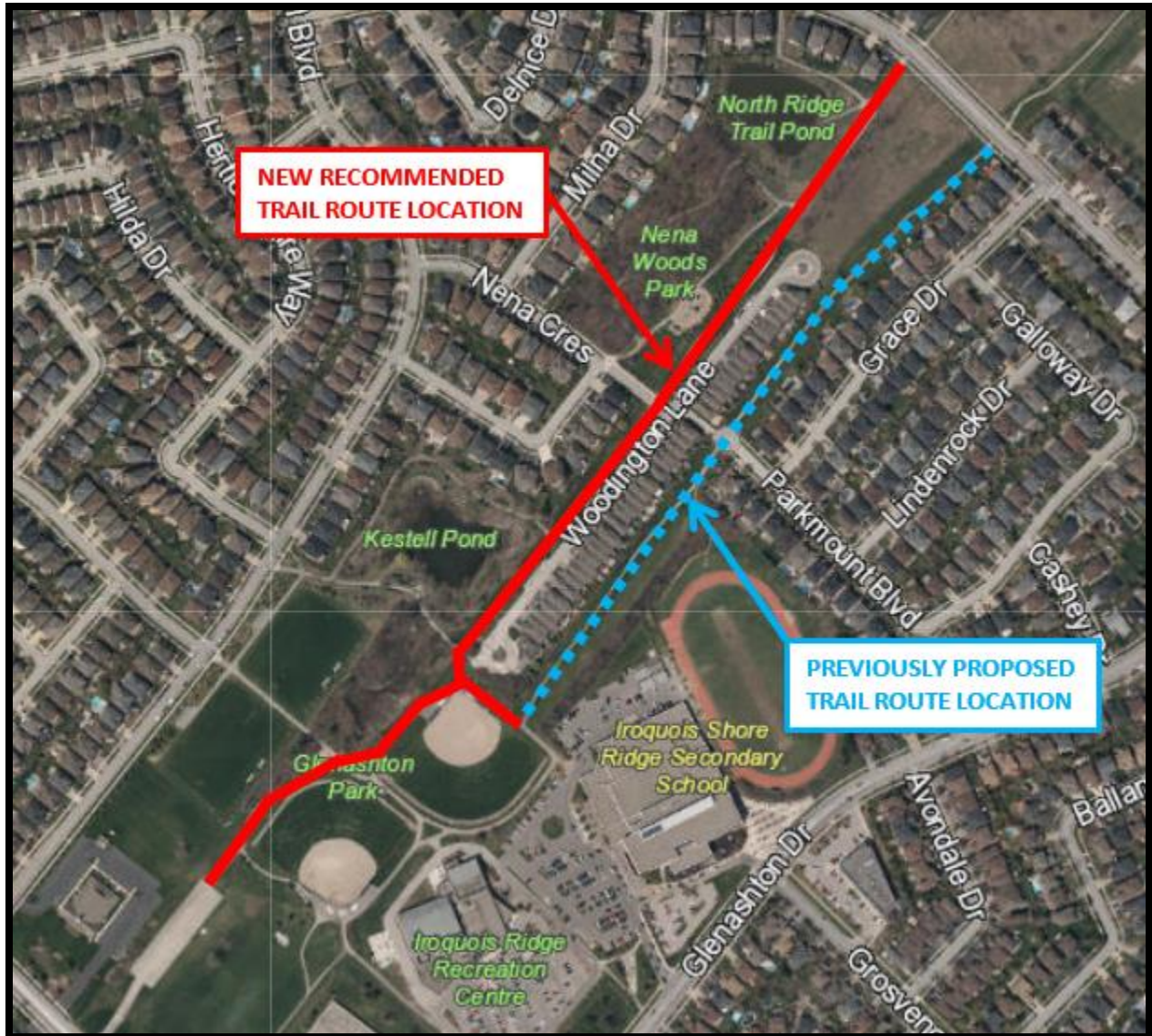
Crosstown Trail Phase 2 – Study Area