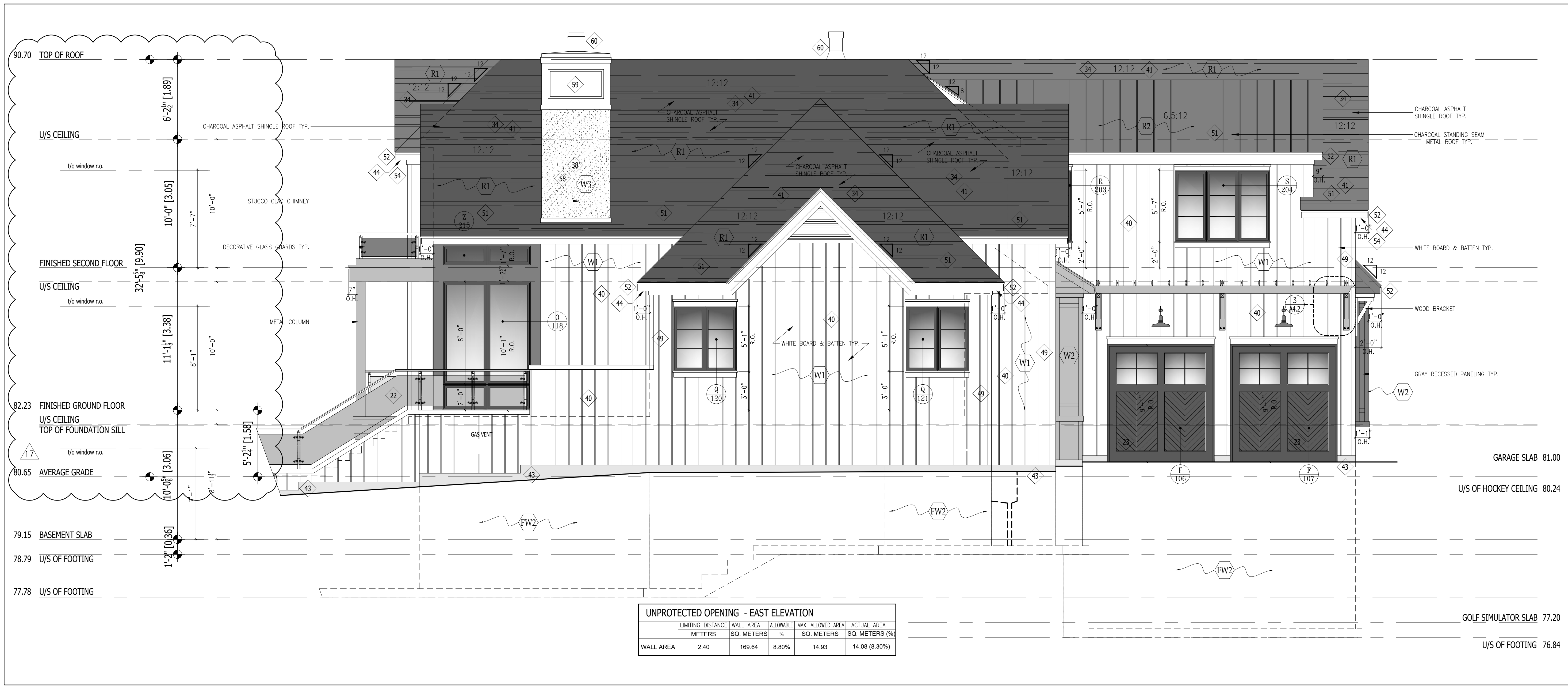
2 EAST ELEVATION SCALE: 1/4"=1'-0"