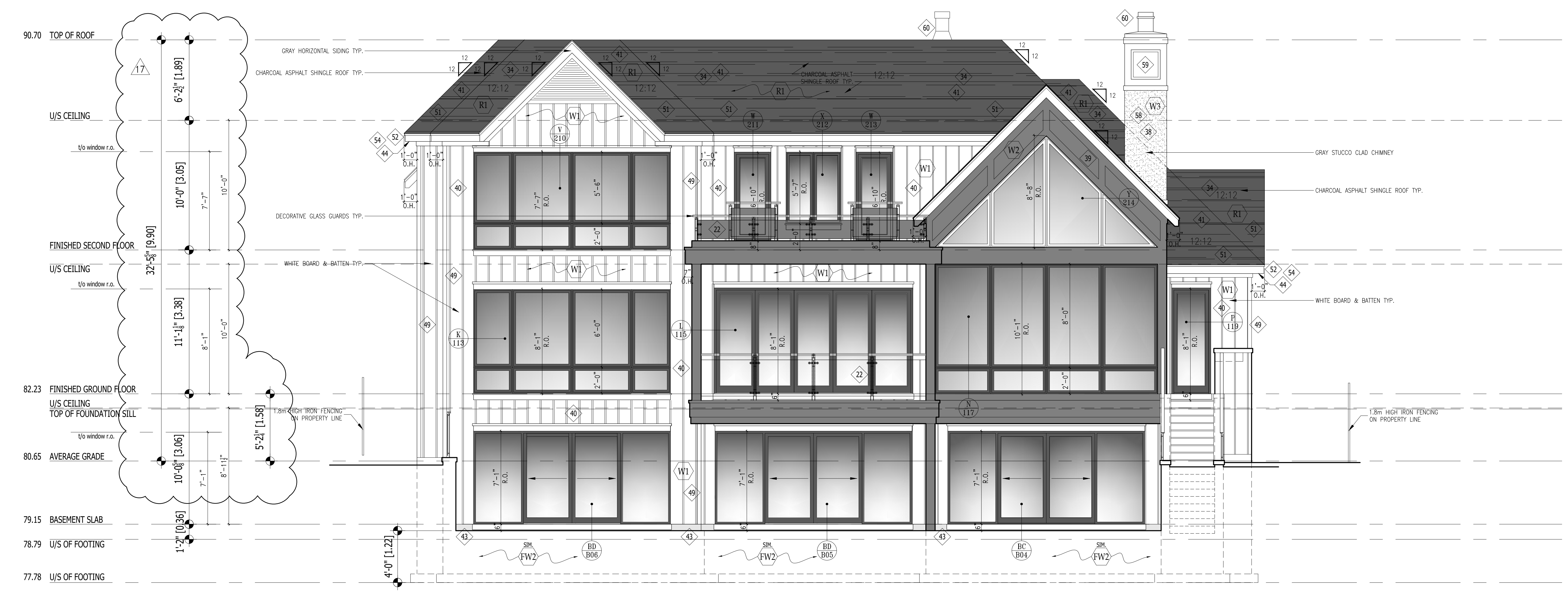
2 SOUTH ELEVATION (LAKESIDE) SCALE: 1/4"=1'-0"

Drawings must NOT be scaled. Contractor must check and verify all dimensions, specifications and drawings on site and report any discrepancies to the Designer prior to proceeding with any of the work. The undersigned has reviewed and takes responsibility for this design, has the qualifications and meets the requirements set out in the Ontario Building Code to be a designer. REGISTRATION AND QUALIFICATION INFORMATION Required unless design is exempt under 2.17.5.1 and/or 2.17.4.1 of the Ontario Building Code FIRM BCIN: 111071 INDIVIDUAL BCIN: 38886 NAME: A. Jarret McNamee SIGNATURE: A. Jarret McNamee This document must be signed above to be valid. Reproductions should not be accepted.