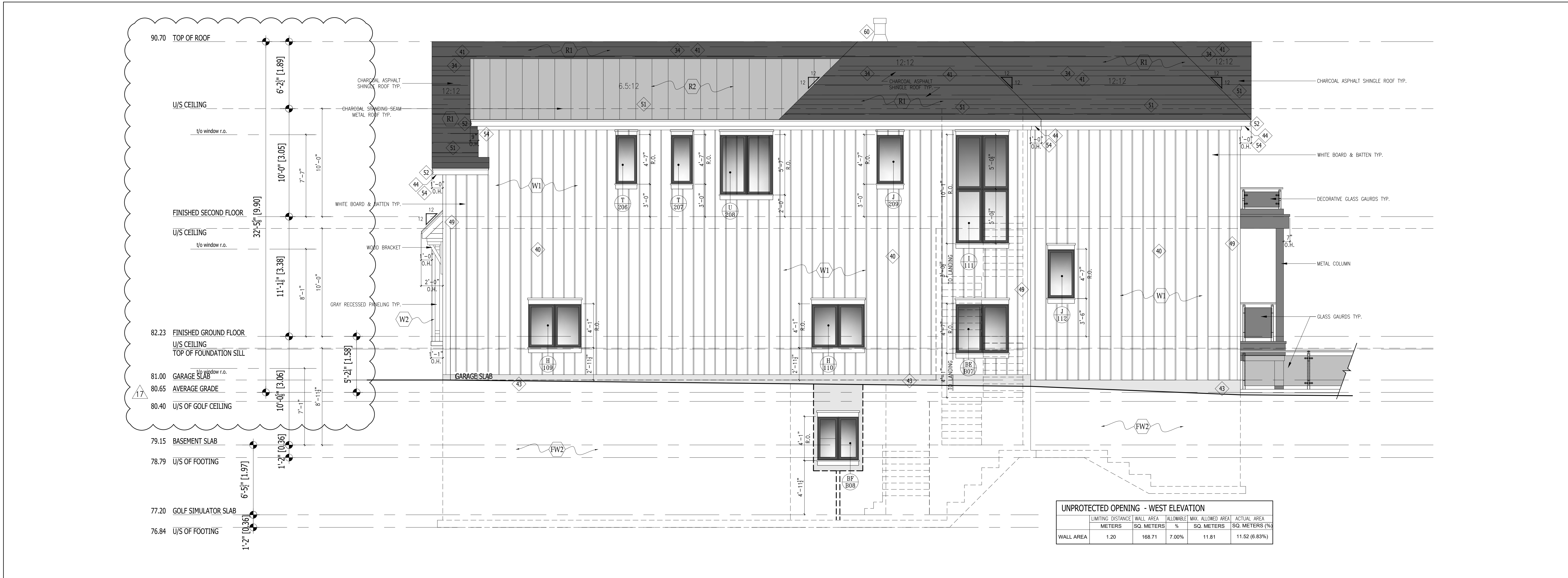
1 WEST ELEVATION SCALE: 1/4"=1'-0"

DRAWN: J.Mc. DATE: 10.12.21 SCALE: 1/4"=1'-0" JOB NUMBER: 435-21 SHEET NUMBER: A4.2