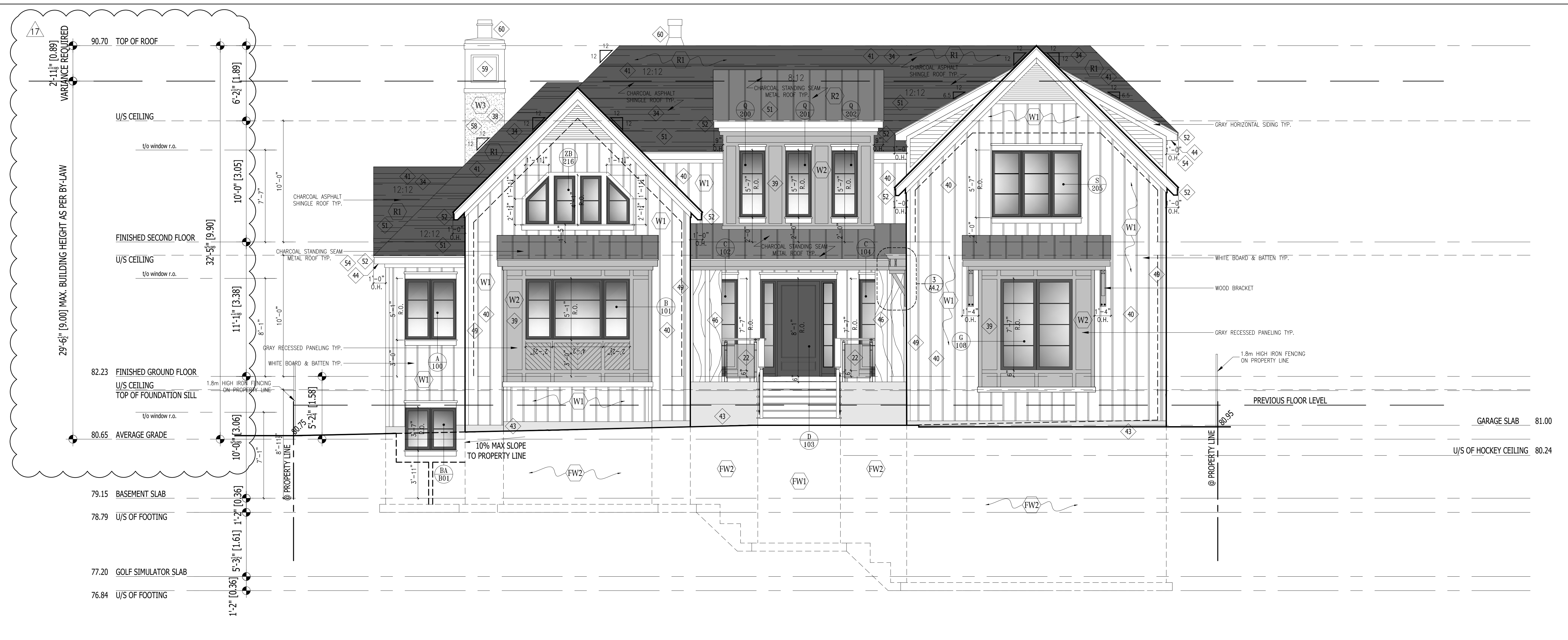
1 NORTH ELEVATION SCALE: 1/4"=1'-0"