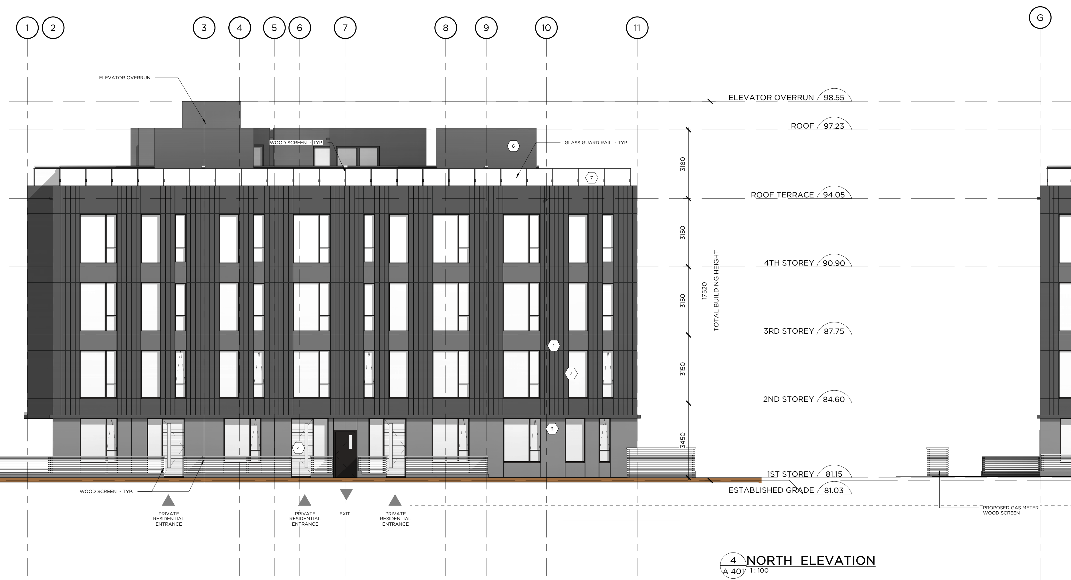
4 NORTH ELEVATION A 40J 1:100