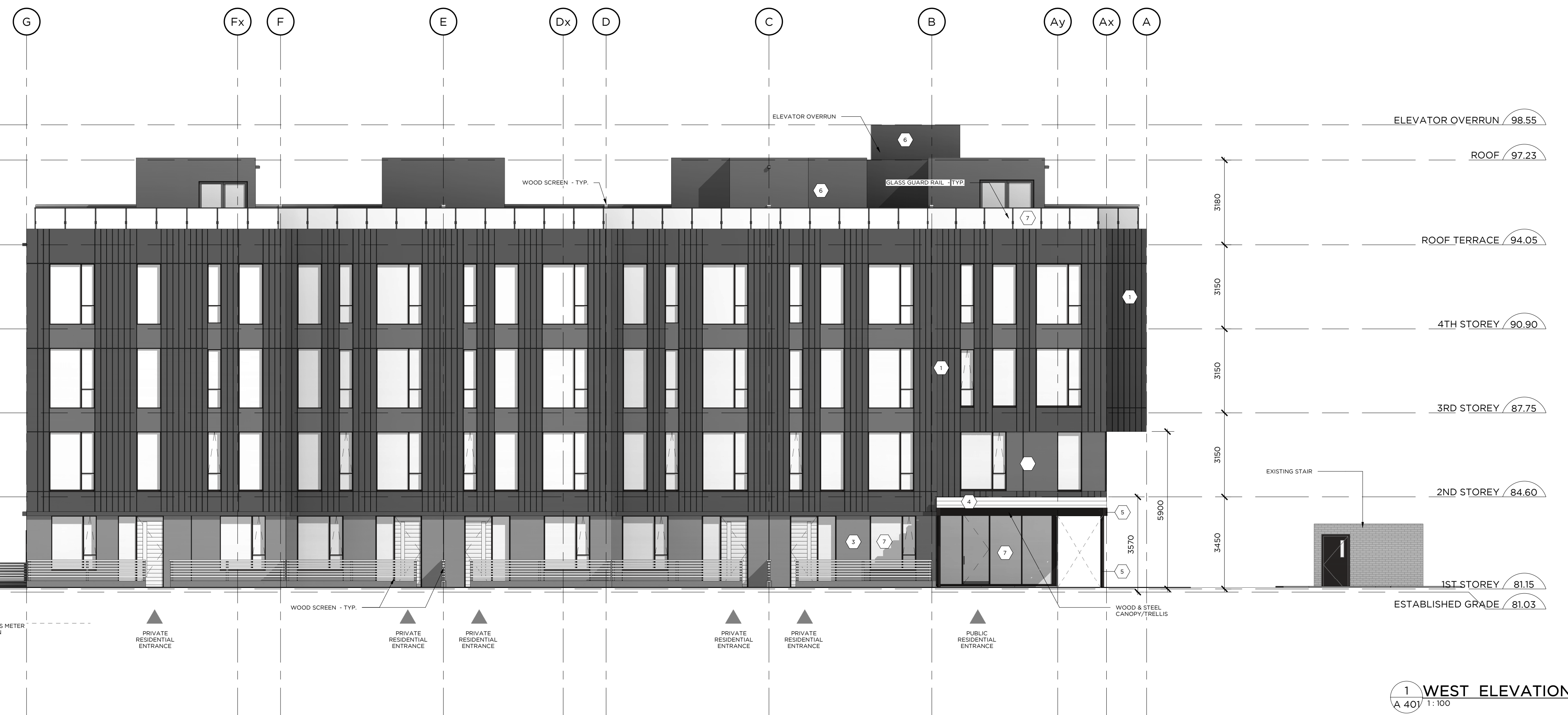
1 WEST ELEVATION A 40J 1:100