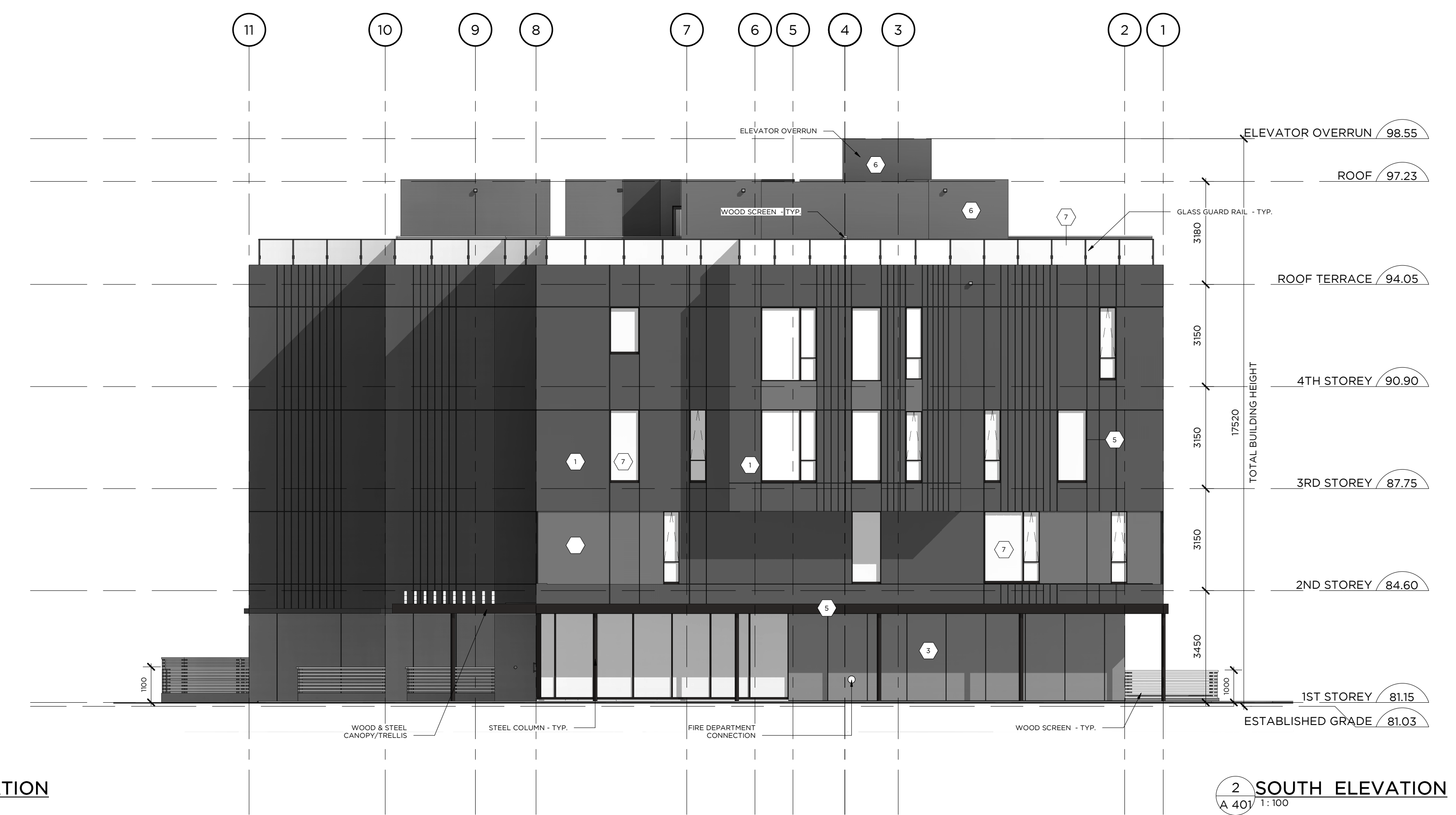
2 SOUTH ELEVATION A 40J 1:100