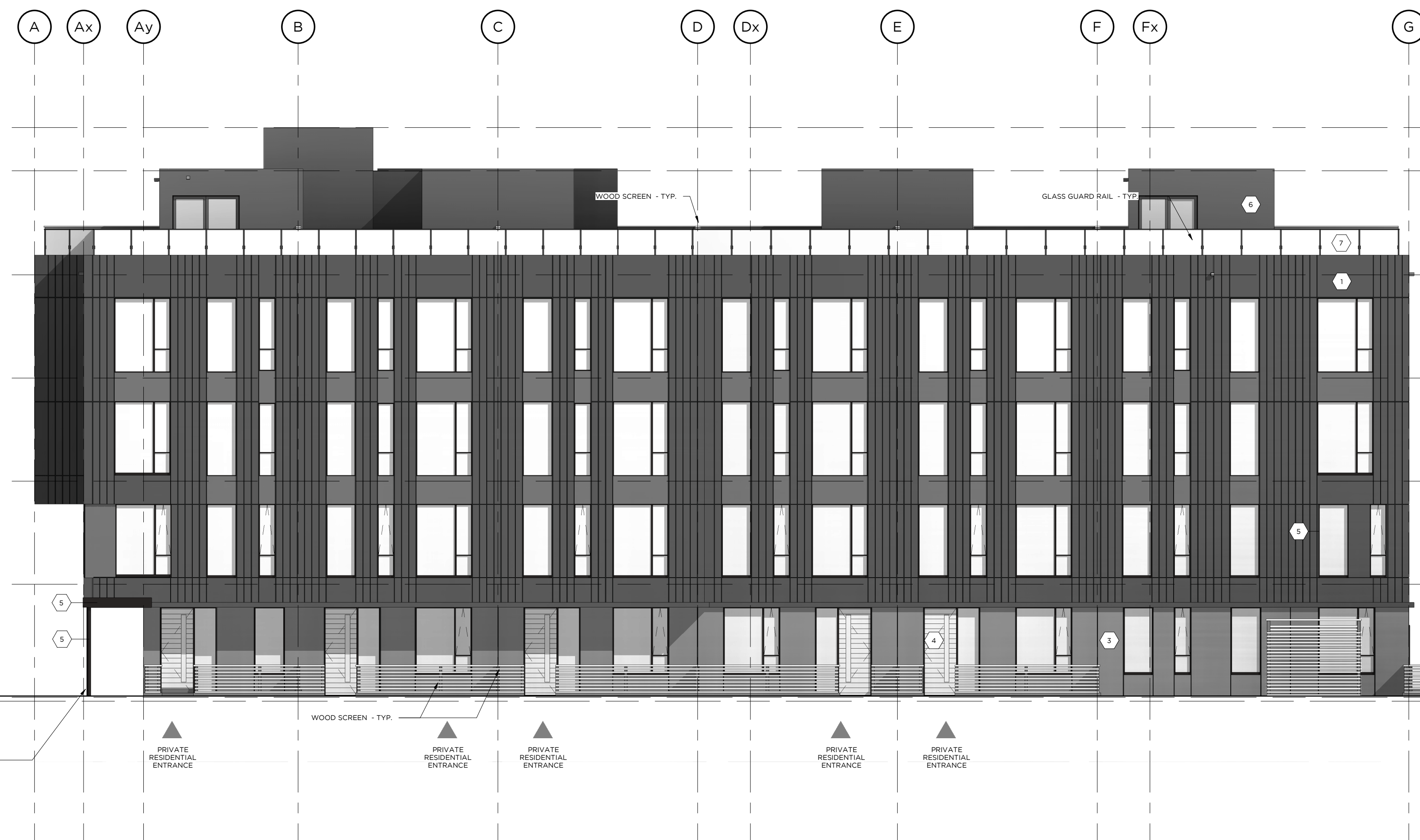
3 EAST ELEVATION A 40J 1:100