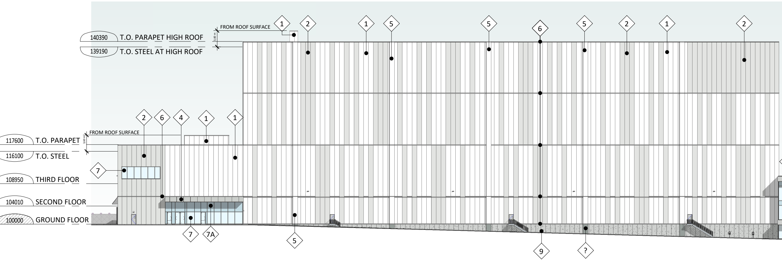
ELEVATION WEST 2 1 : 500 P420