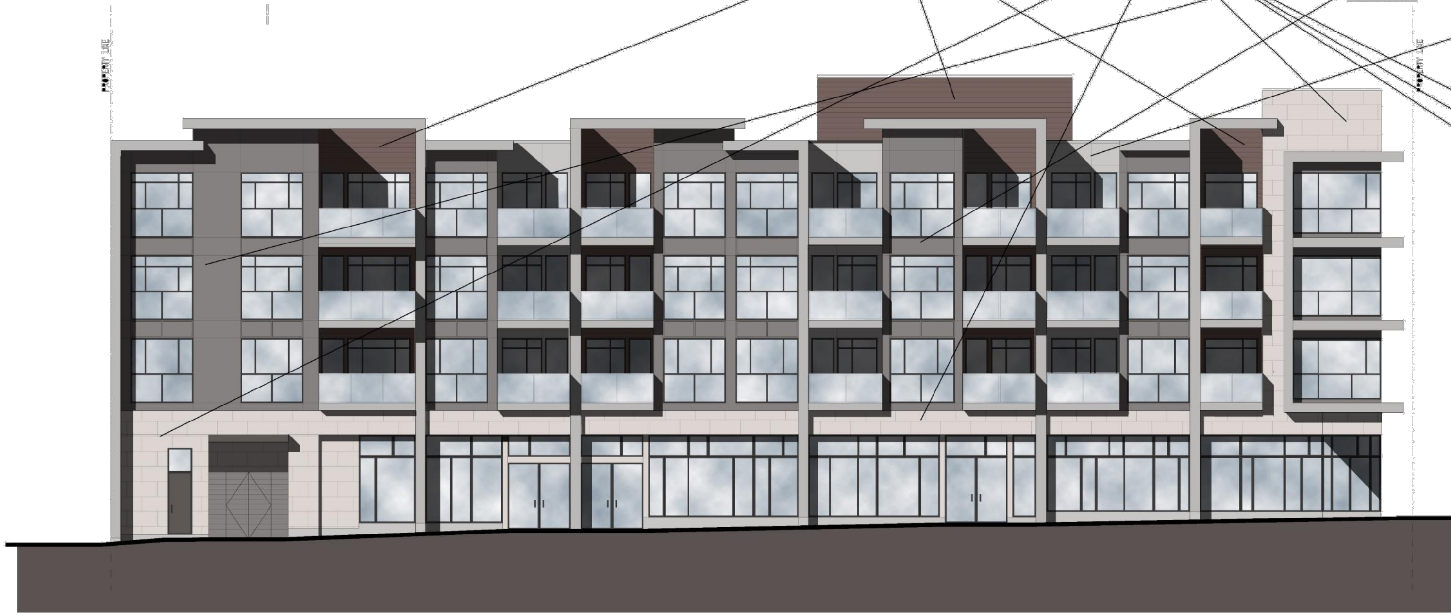
KERR ST. ELEVATION