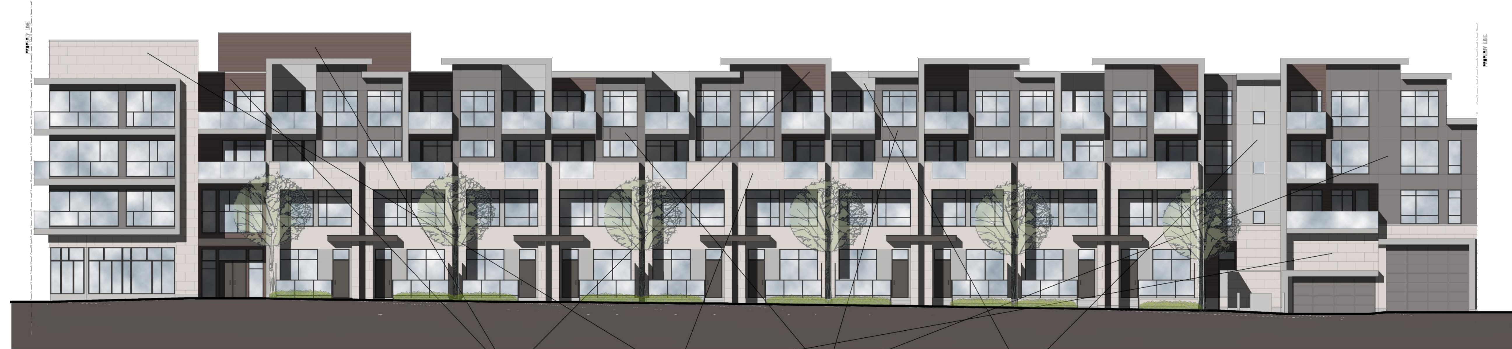
DEANE AVE. ELEVATION

All drawings are the property of the Architect and must be returned upon request. Contractor shall check all dimensions and report any discrepancies to the Architect before proceeding with the work. The contractor and/or engineer shall verify u/s footing elevations and soil bearing capacity prior to excavation and the commencement of work. DO NOT SCALE DRAWINGS