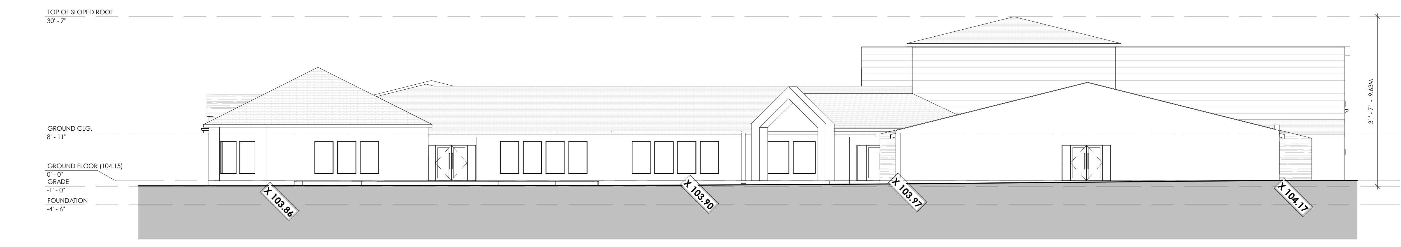
EXISTING RIGHT ELEVATION - FOR REFERENCE ONLY