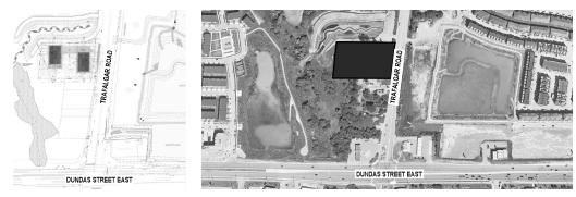
2 Context Plan SCALE: 1:5000 3 Key Plan SCALE: 1:5000