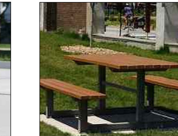
PICNIC TABLE IN AMENITY SPACE