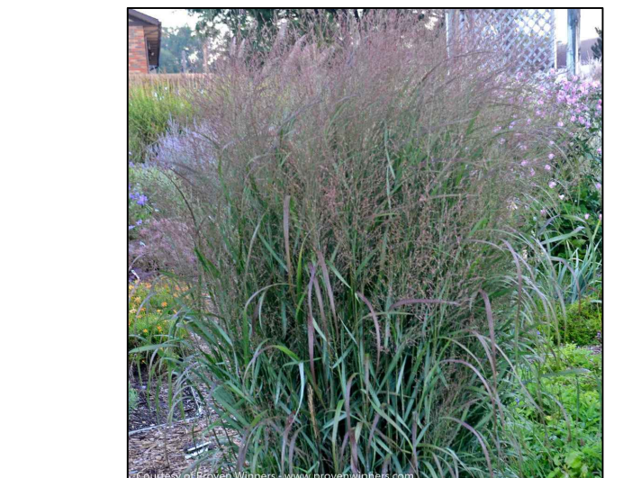
TALL GRASS IN PERENNIAL PLANTING