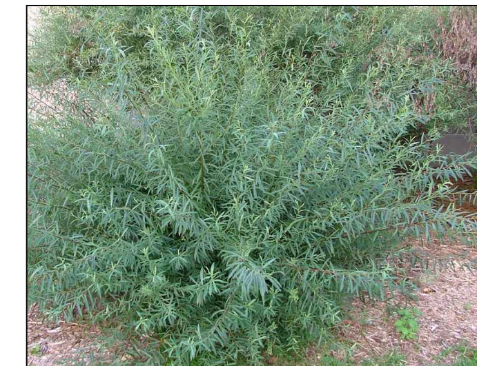
SHRUBS FOR ENTRANCE GARDENS