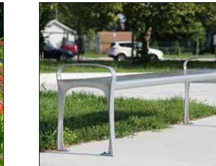
BENCH BY AMENITY SPACE