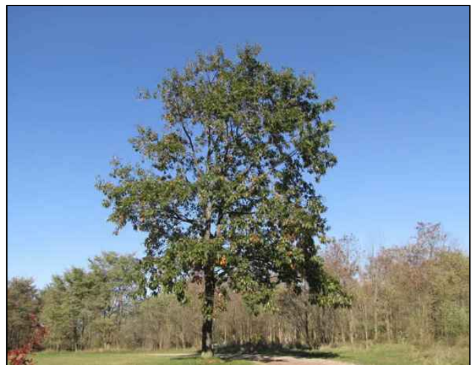
RED OAK - TYPICAL BOULEVARD TREE