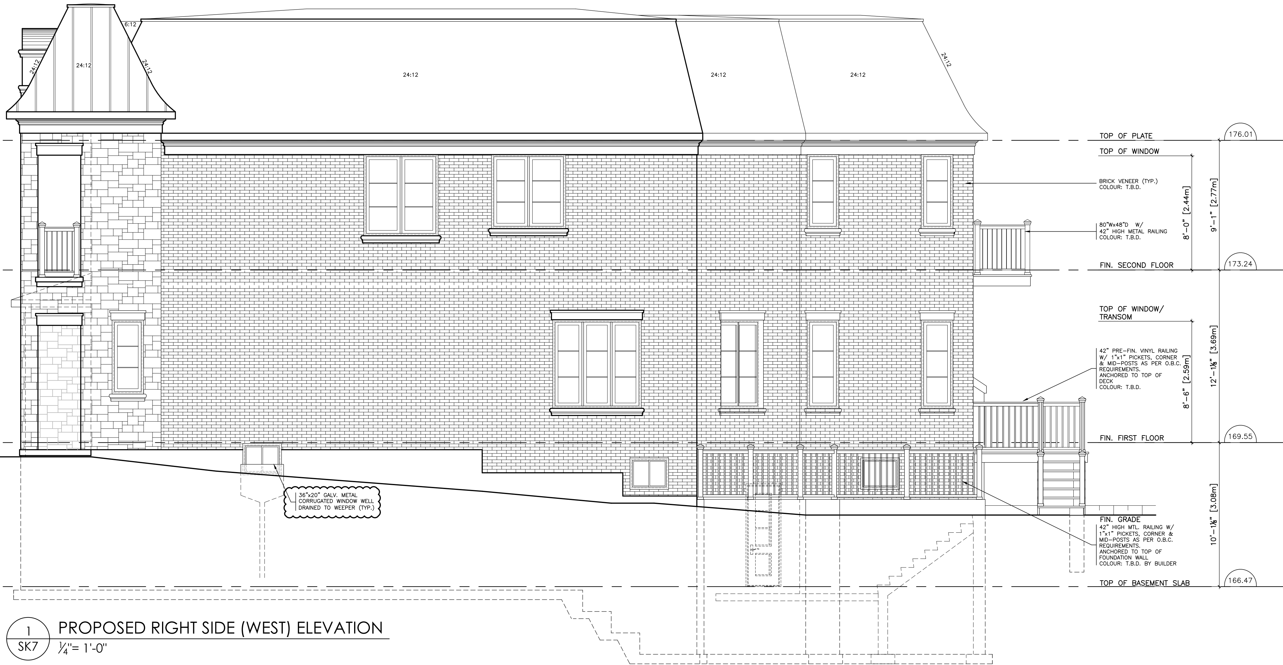
1 PROPOSED RIGHT SIDE (WEST) ELEVATION SK7 1/4" = 1'-0"