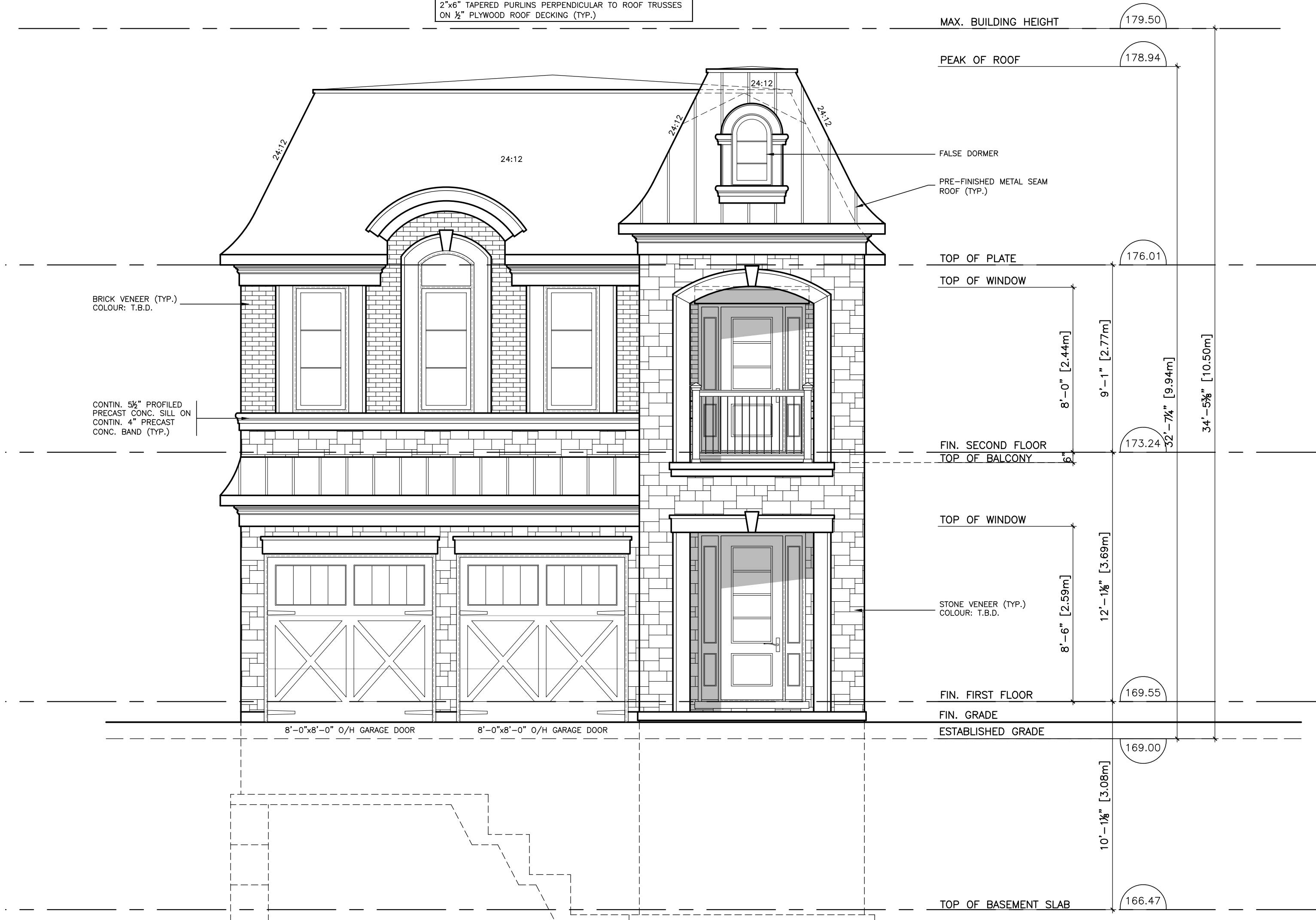
1 SK5 PROPOSED FRONT (NORTH) ELEVATION 1/4" = 1'-0"

NOTE: PROVIDE 2-PLY TORCH DOWN ROOFING MEMBRANE ON PROTECTION BOARD ON 1/2" EXTERIOR GRADE PLYWOOD ON 2"x8" TAPERED PURLINS PERPENDICULAR TO ROOF TRUSSES ON 1/2" PLYWOOD ROOF DECKING (TYP.)