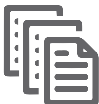
Written materials and alternative formats