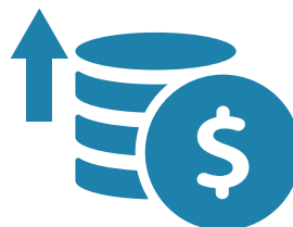
Increase your events' economic impact