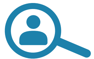
15% of Oakville residents identify as having a disability