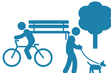
Enhance Oakville's livability