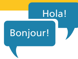
People not fluent in English