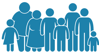
Increase your audience and attendance