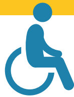
People with disabilities