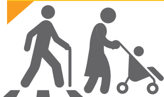
Paths of travel