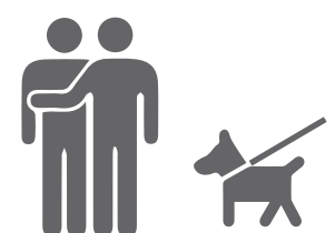
Support persons/ service animals