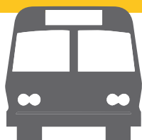
Public transit access