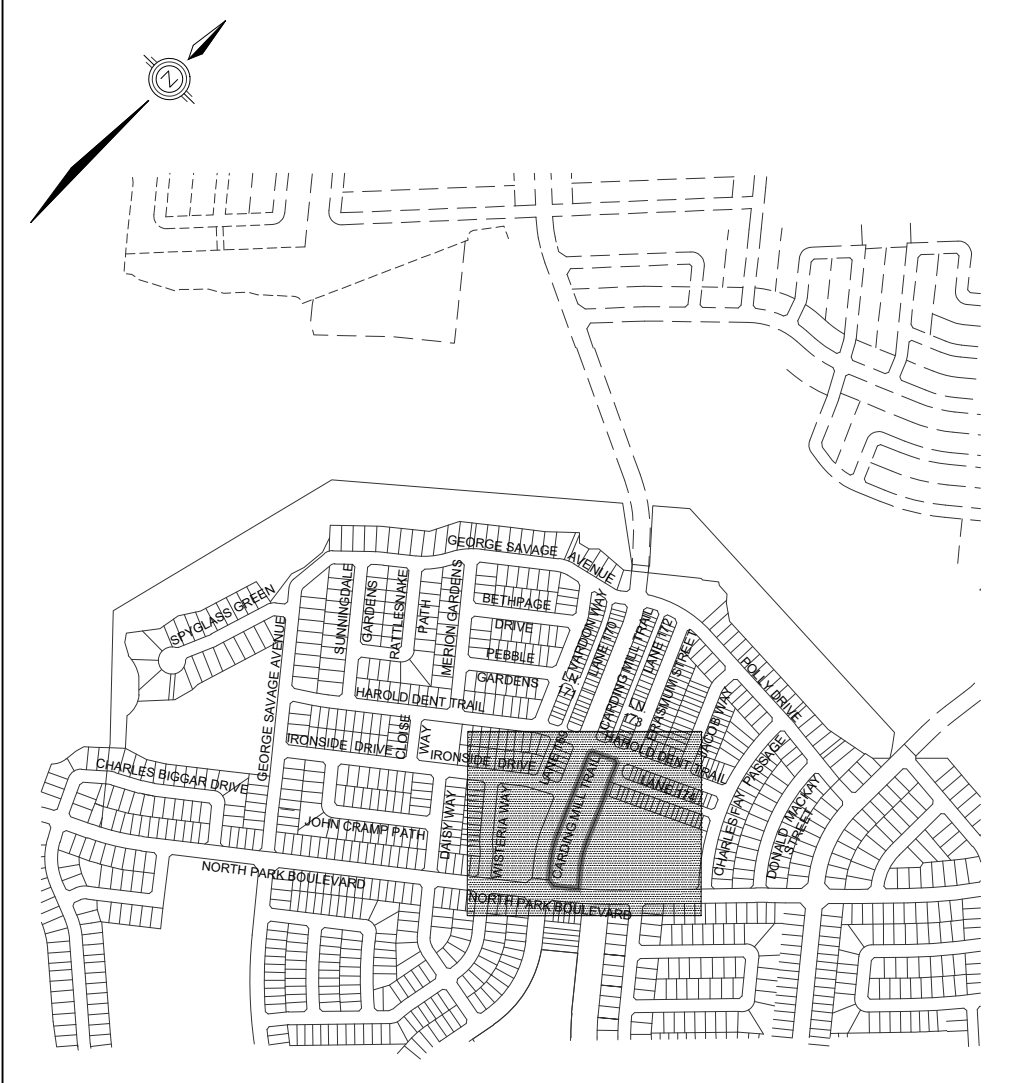
KEY PLAN SCALE 1:10000

TOPOGRAPHIC INFORMATION TOPOGRAPHIC INFORMATION PROVIDED BY RADY-PENKIE & EDWARD SURVEYING LTD.: JOB No. 16-146, TOPOGRAPHIC SURVEY DATED ON JULY 5, 2016 AND DATED JULY 20, 2016. MARESHILL MACLIN MONAGHAN ONTARIO LTD., JOB No. 20-05052-00-000, TOPOGRAPHIC SURVEY DATED JUNE 11, 2005 TO JULY 21, 2005. SITE PLAN INFORMATION SITE PLAN PROVIDED BY 04 ARCHITECTS INC., JOB No. 20009, RECEIVED ON AUGUST 12, 2021.