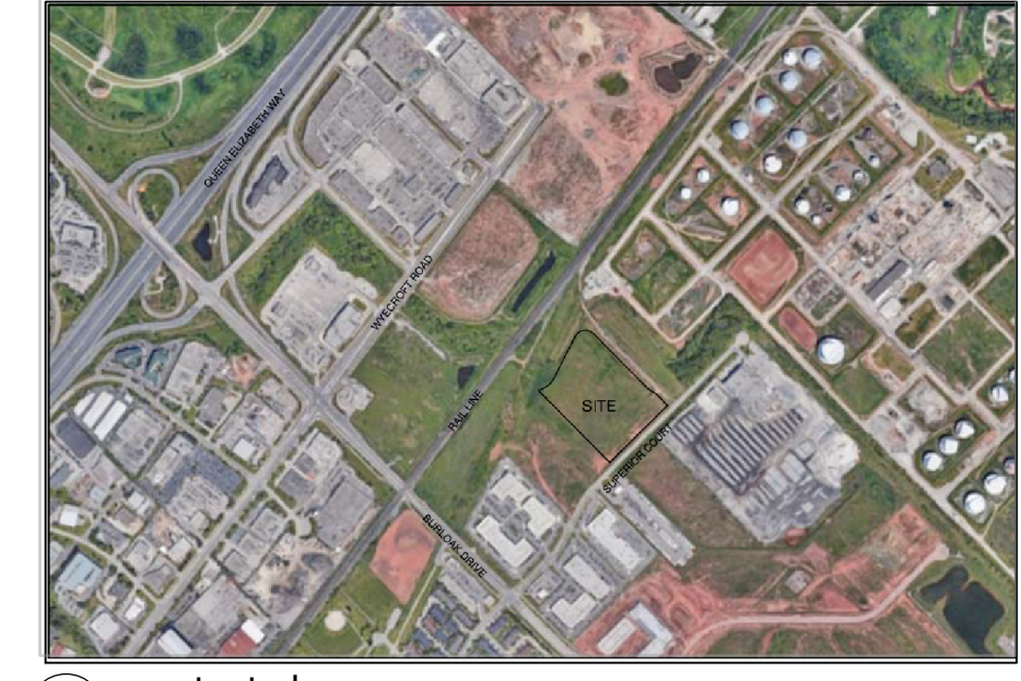
1 context plan SCALE n.t.s.

ALL WORK SHALL BE CARRIED OUT IN STRICT ACCORDANCE WITH THE REQUIREMENTS OF THE LATEST REVISION OF THE ONTARIO BUILDING CODE AND ANY OTHER AUTHORITY HAVING JURISDICTION. ALL DIMENSIONS TO BE CHECKED AND VERIFIED AT THE SITE BY EACH CONTRACTOR. ANY DISCREPANCIES AND/OR ERRORS SHALL BE REPORTED IN WRITING TO THE CONSULTANT BEFORE COMMENCING ANY WORK. ALL DRAWINGS ARE THE COPYRIGHT OF THE CONSULTANT AND REMAIN THE PROPERTY OF THE CONSULTANT.