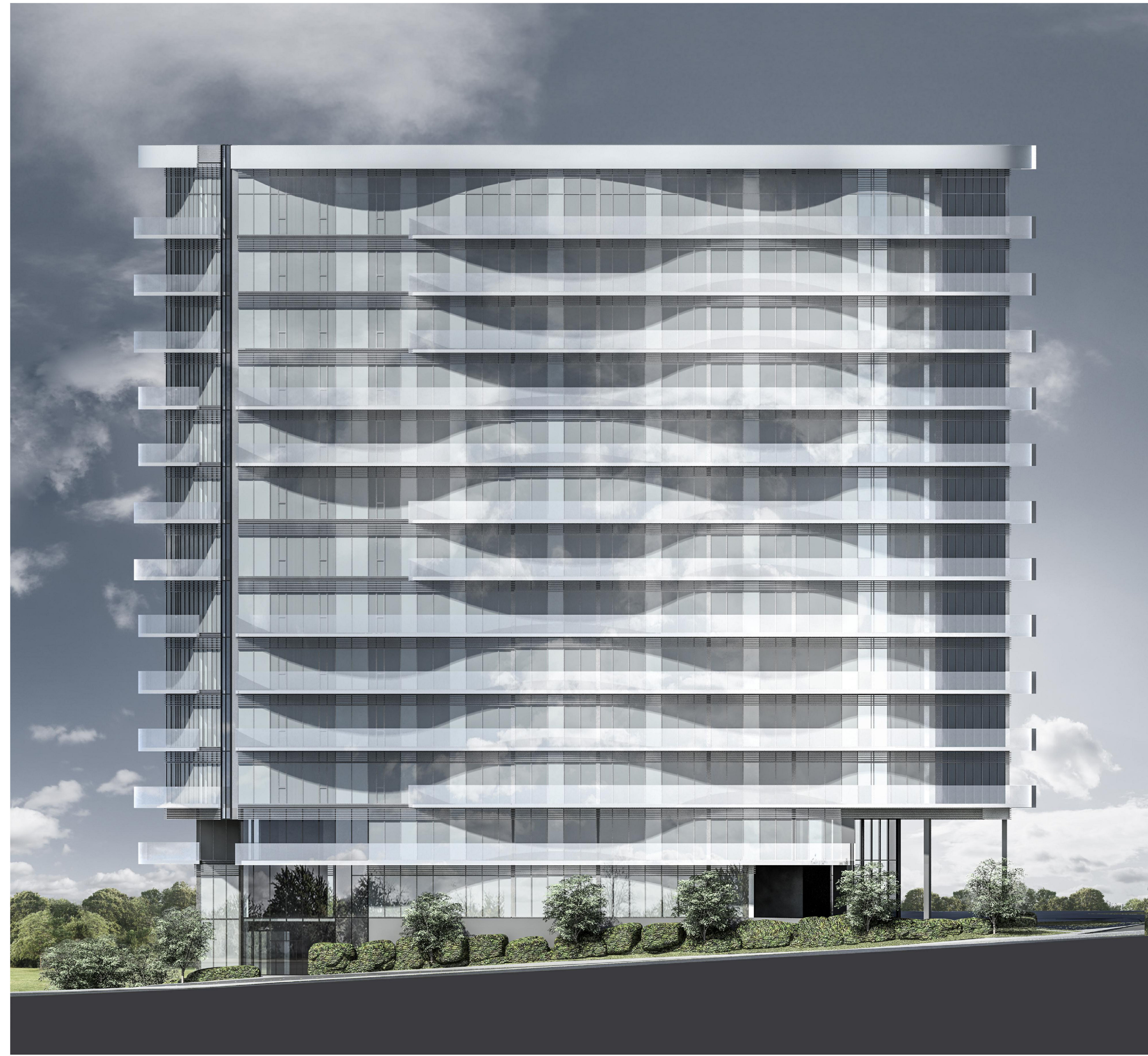
NORTH ELEVATION RENDERING 1 1:150 A400