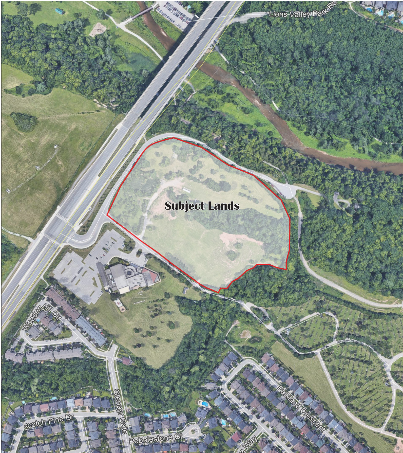
Figure 1 Location Map