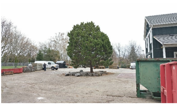
Tree 660 looking North.