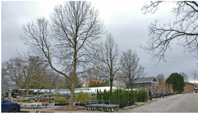
Trees 665 through 667 looking South.