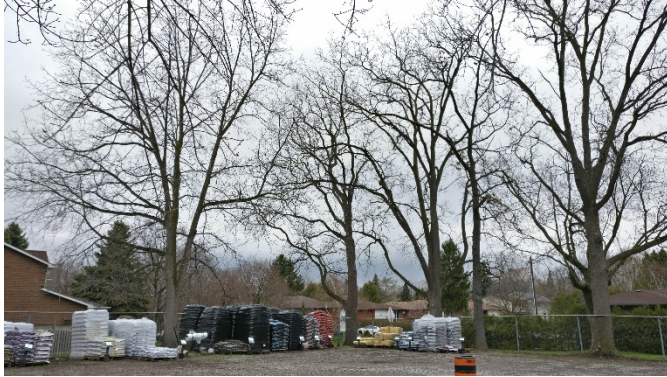
Trees 943 through 947 looking North East.