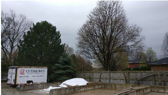
Trees 658, 659, O1 looking South West.