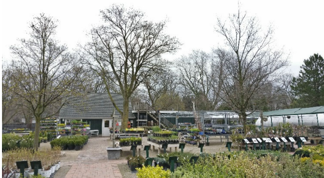
Trees 668 through 670 looking East.