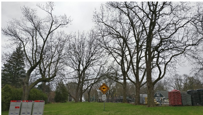
Trees 960 through 964, 697 through 700, 664 looking East.