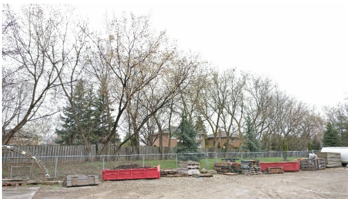
Trees 911 through 939, 955 through 959 looking North West.