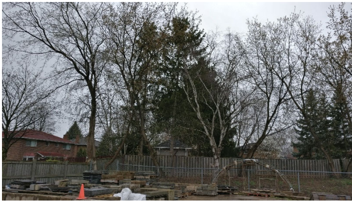
Trees 907 through 911 looking West.