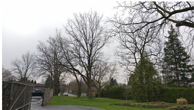
Trees 697 through 700, 960 through 964, 664 looking West.