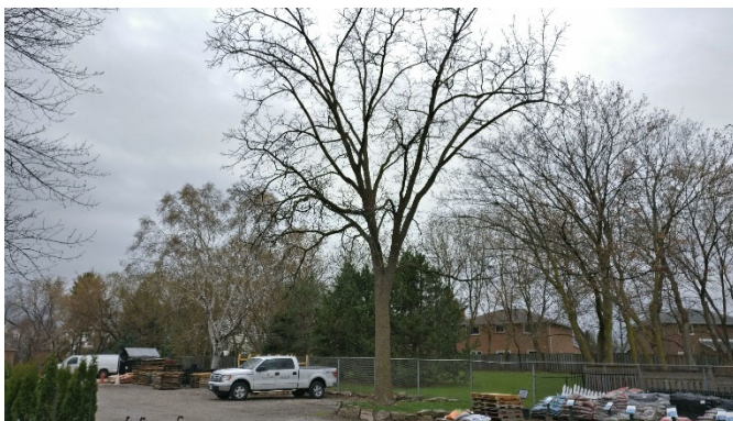
Trees 950 through 959, 661 looking South West.