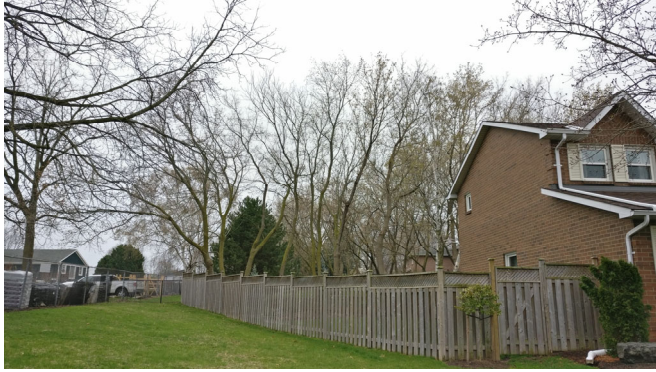
Trees 949 through 954 looking South.