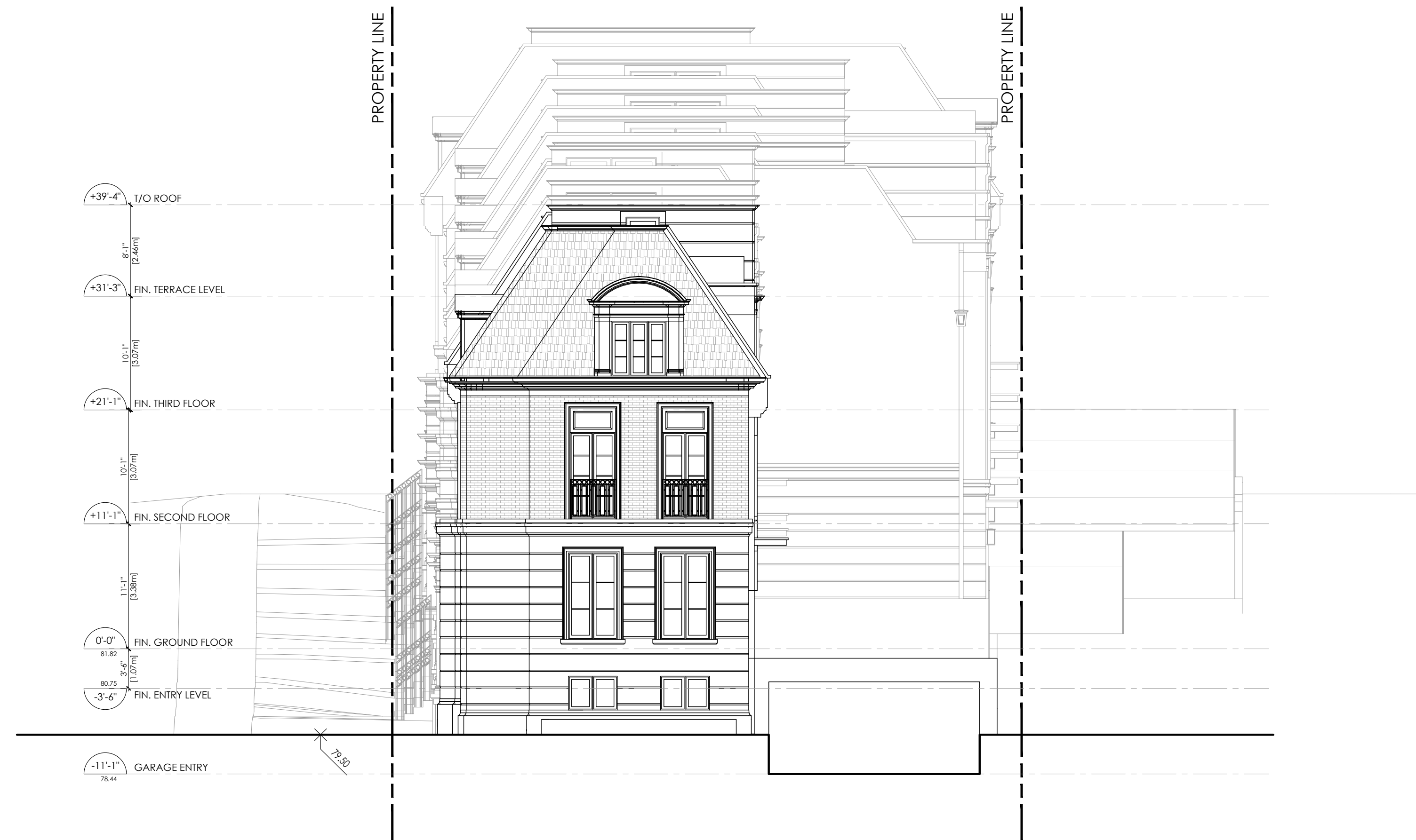
2 WEST ELEVATION SCALE: 1/8" = 1'-0"

The Architect is not responsible for the accuracy of survey, structural, mechanical, electrical, etc., engineering information shown on the drawing. Refer to the appropriate engineering drawings before proceeding with work. Contractor shall check all dimensions on the work and report any discrepancy to the Architect before proceeding. Construction must conform to all applicable Codes and Requirements of Authorities having Jurisdiction. All drawings, specifications and related documents are the copyright property of the Architect and must be returned upon request. Reproduction of drawings, specifications and related documents in part or whole is forbidden without the Architect's permission. This drawing is not to be scaled. This drawing is not to be used for construction unless signed by the Architect. Issued for Construction Signature: _____ Date: _____