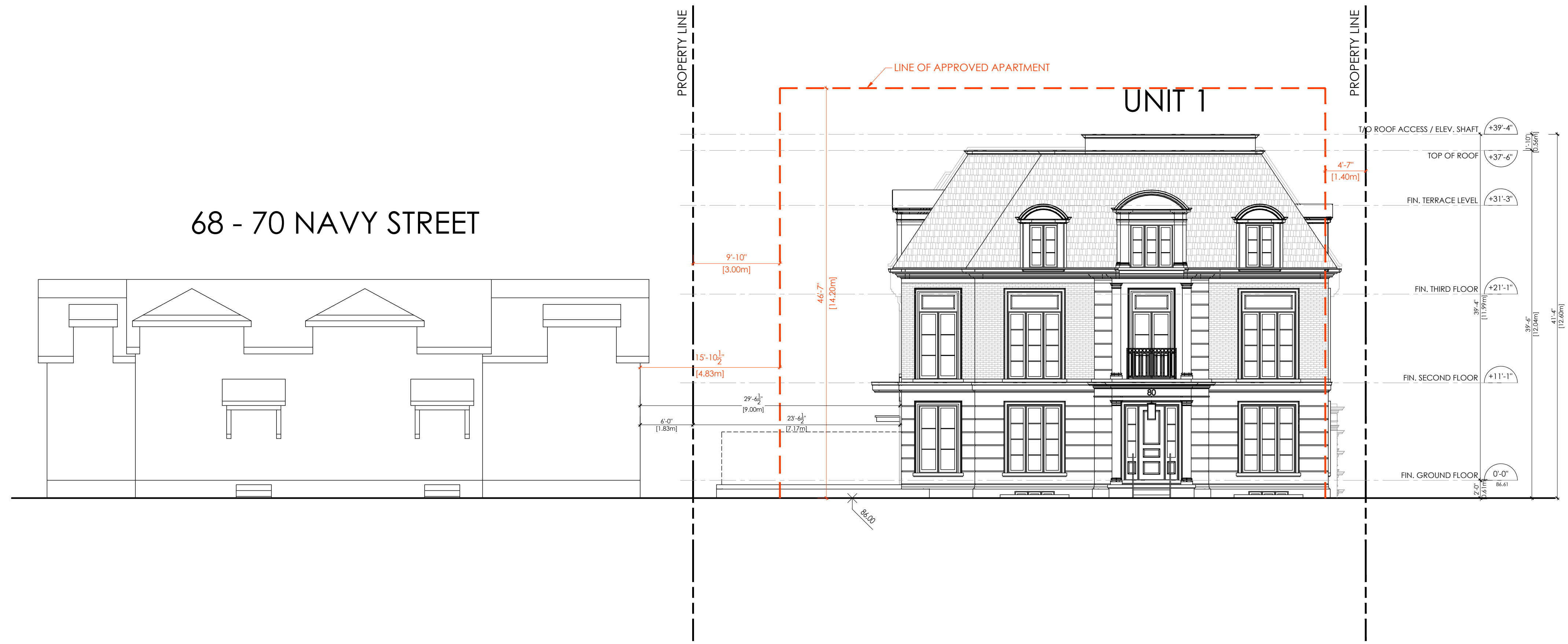
1 EAST ELEVATION SCALE: 1/8" = 1'-0"