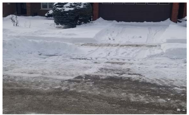
Not bare pavement