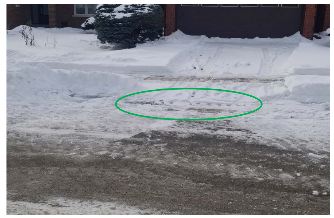
Snow packed condition acceptable