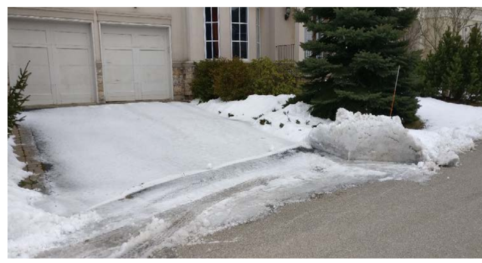
Damage to driveway, landscaping/trees