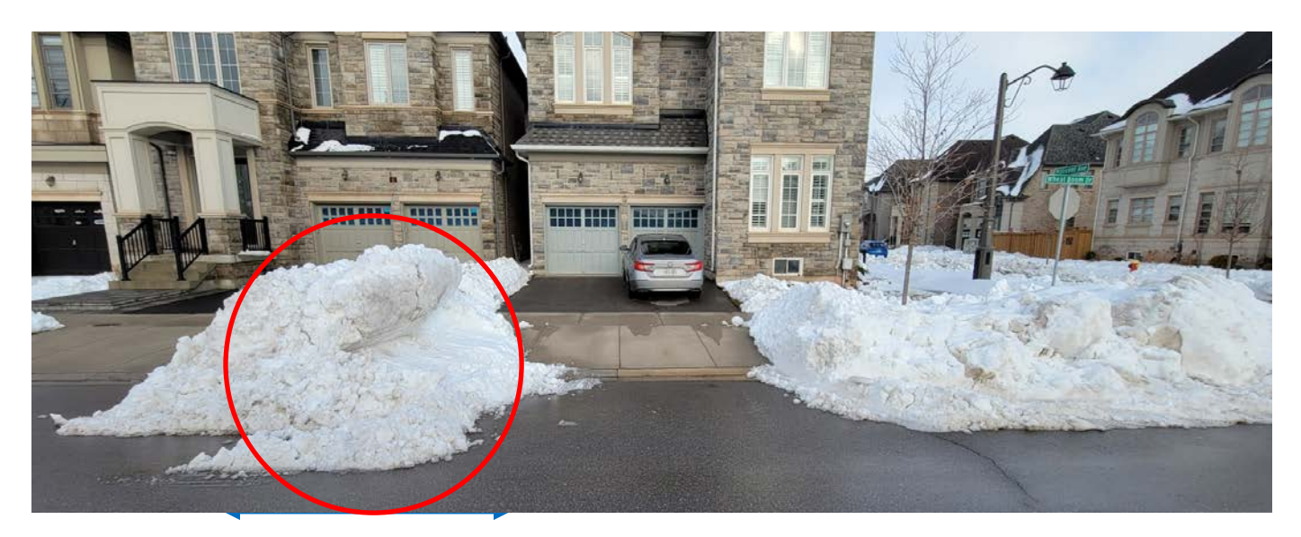
Snowbanks will not be cleared / shaped