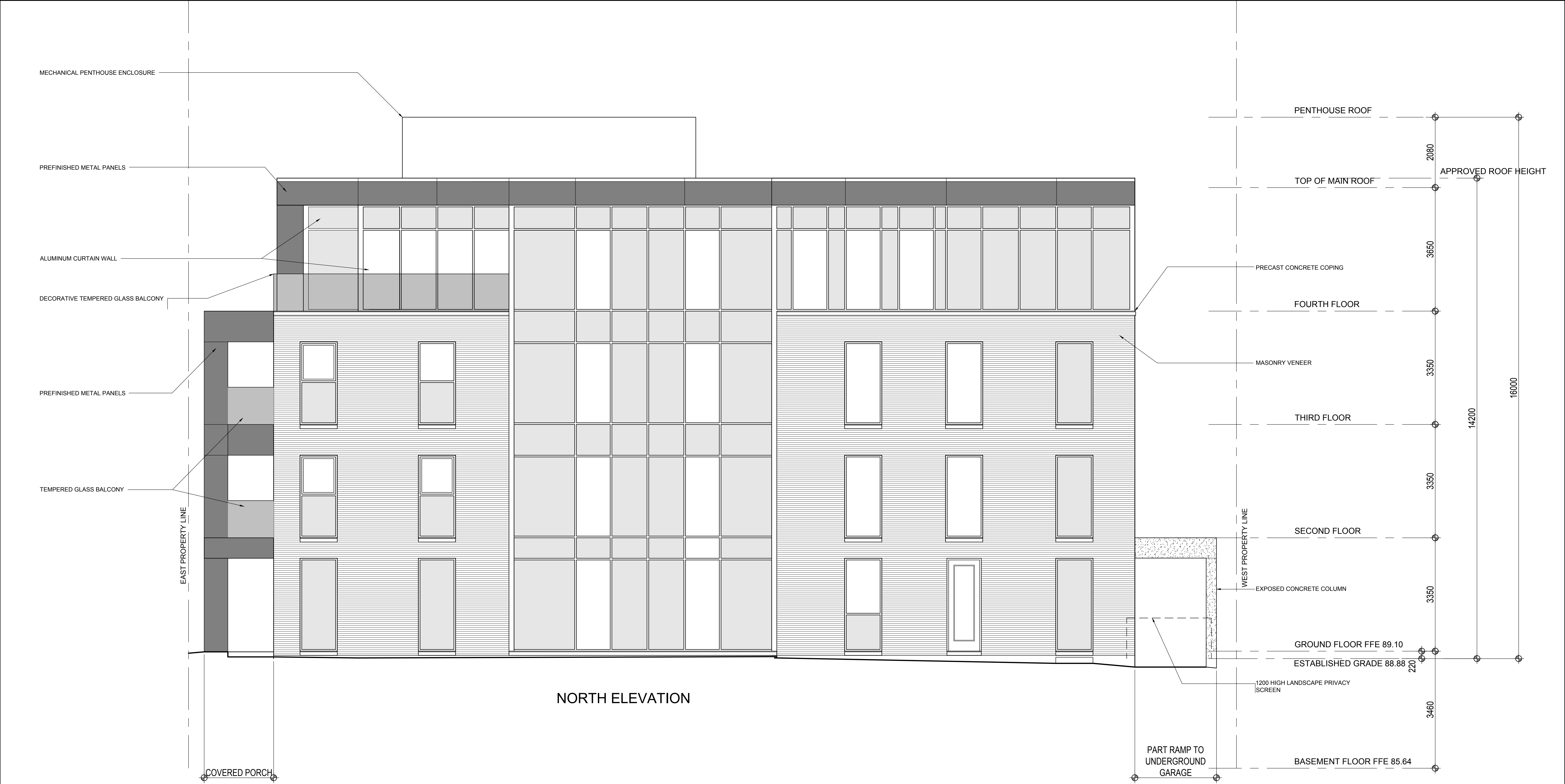
1 NORTH ELEVATION SCALE: 1/50

Drawings must NOT be scaled. Contractor must check and verify all dimensions, specifications and drawings on site and report any discrepancies to the architect prior to proceeding with any of the work.