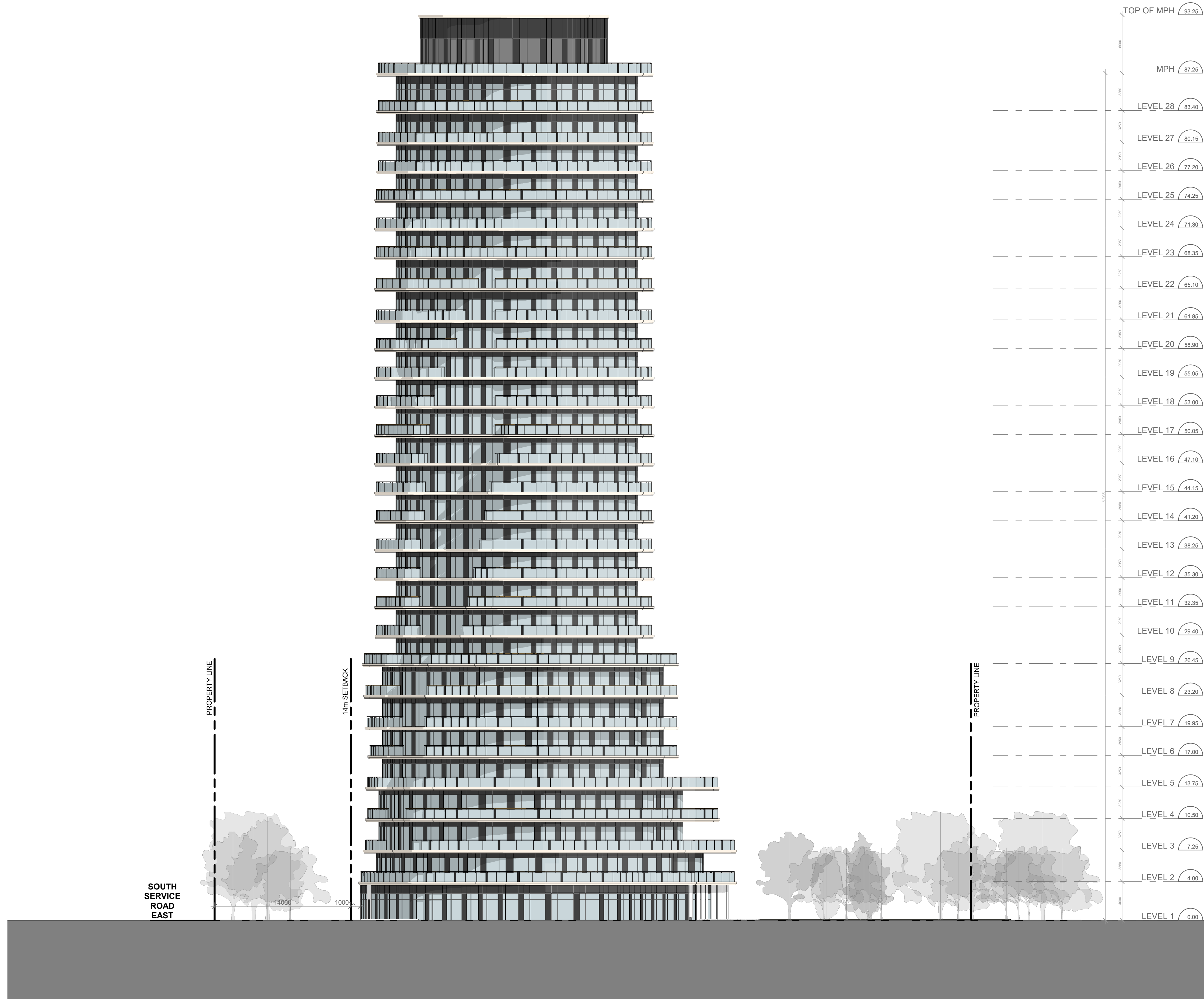
Elevation - West 1 : 200