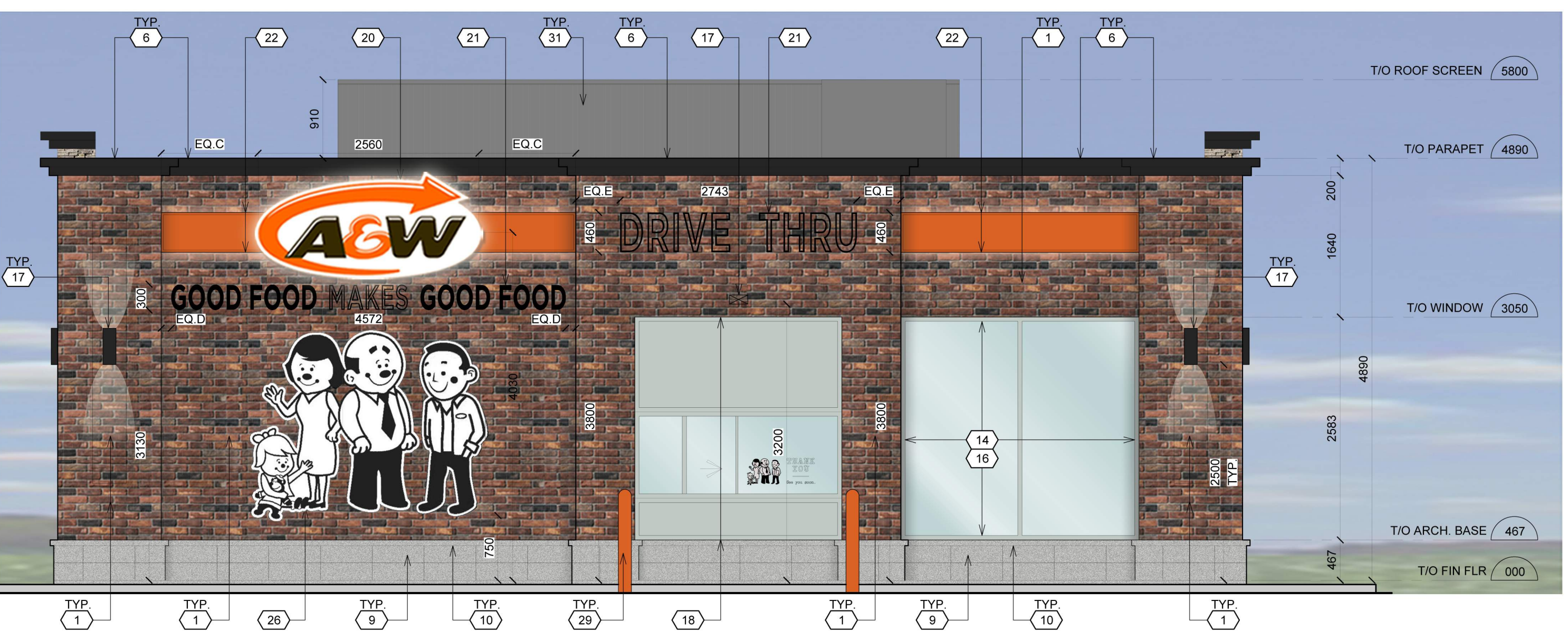
4 WEST ELEVATION