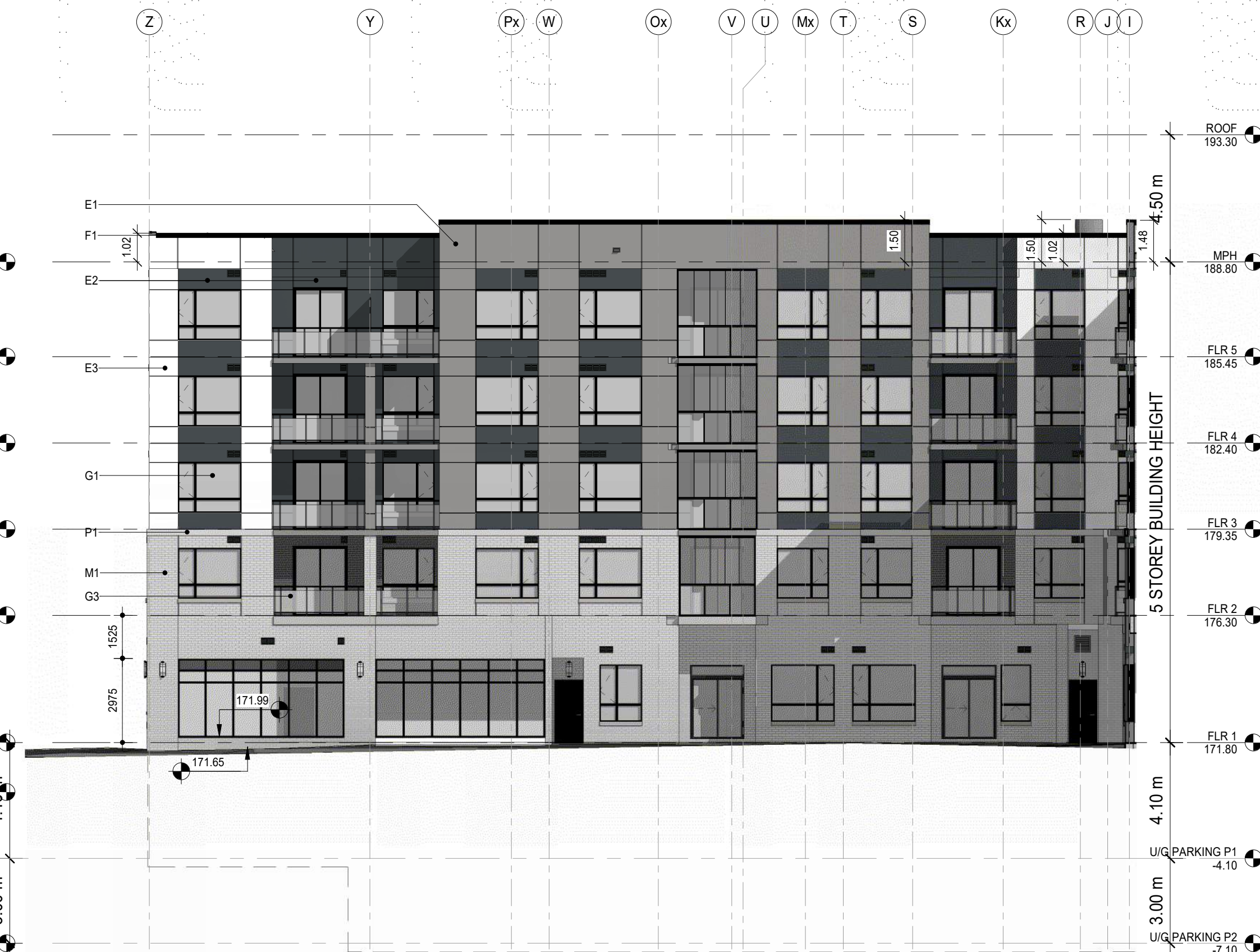
4 SPA - COURTYARD NORTH ELEVATION