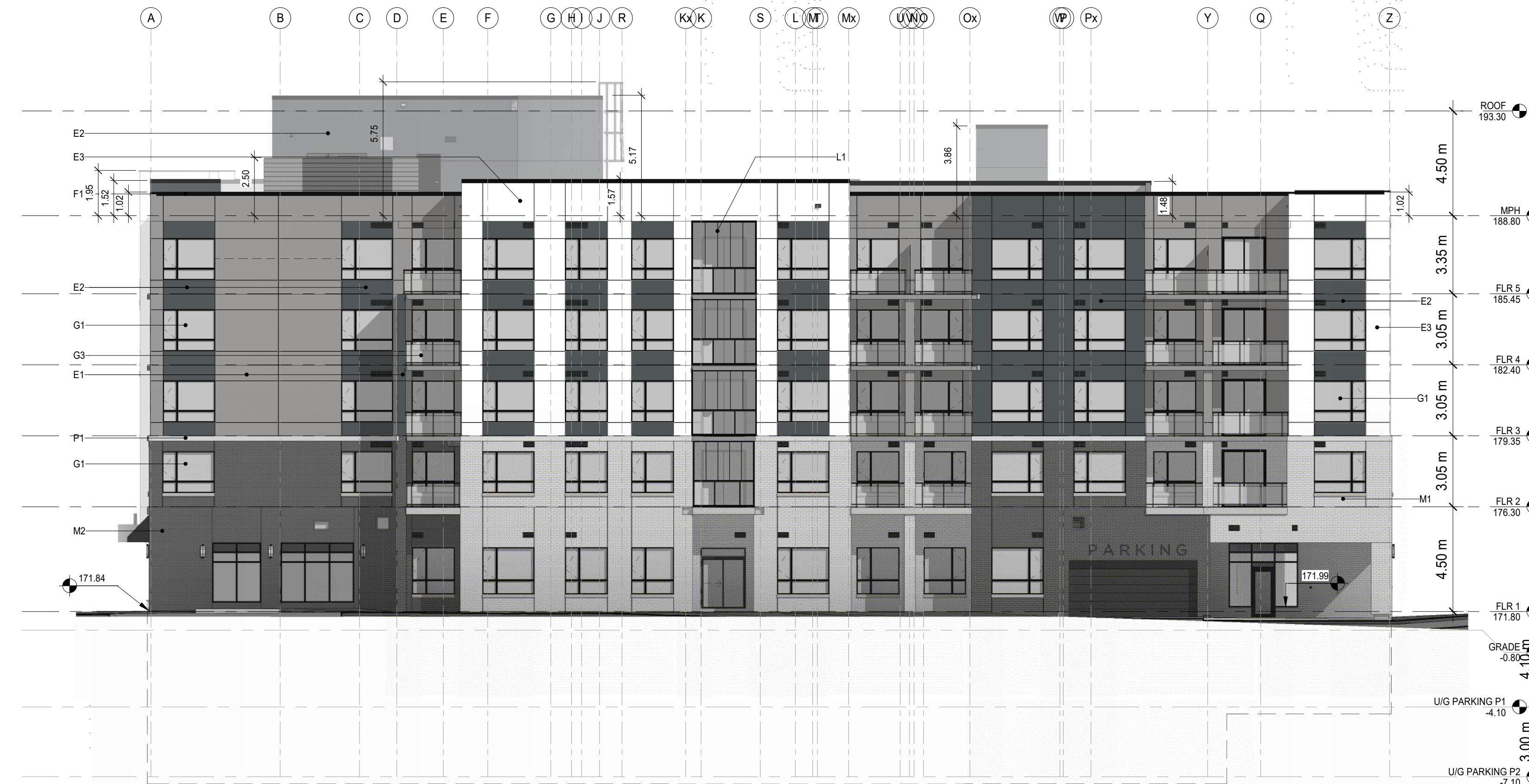
2 SPA - NORTH ELEVATION