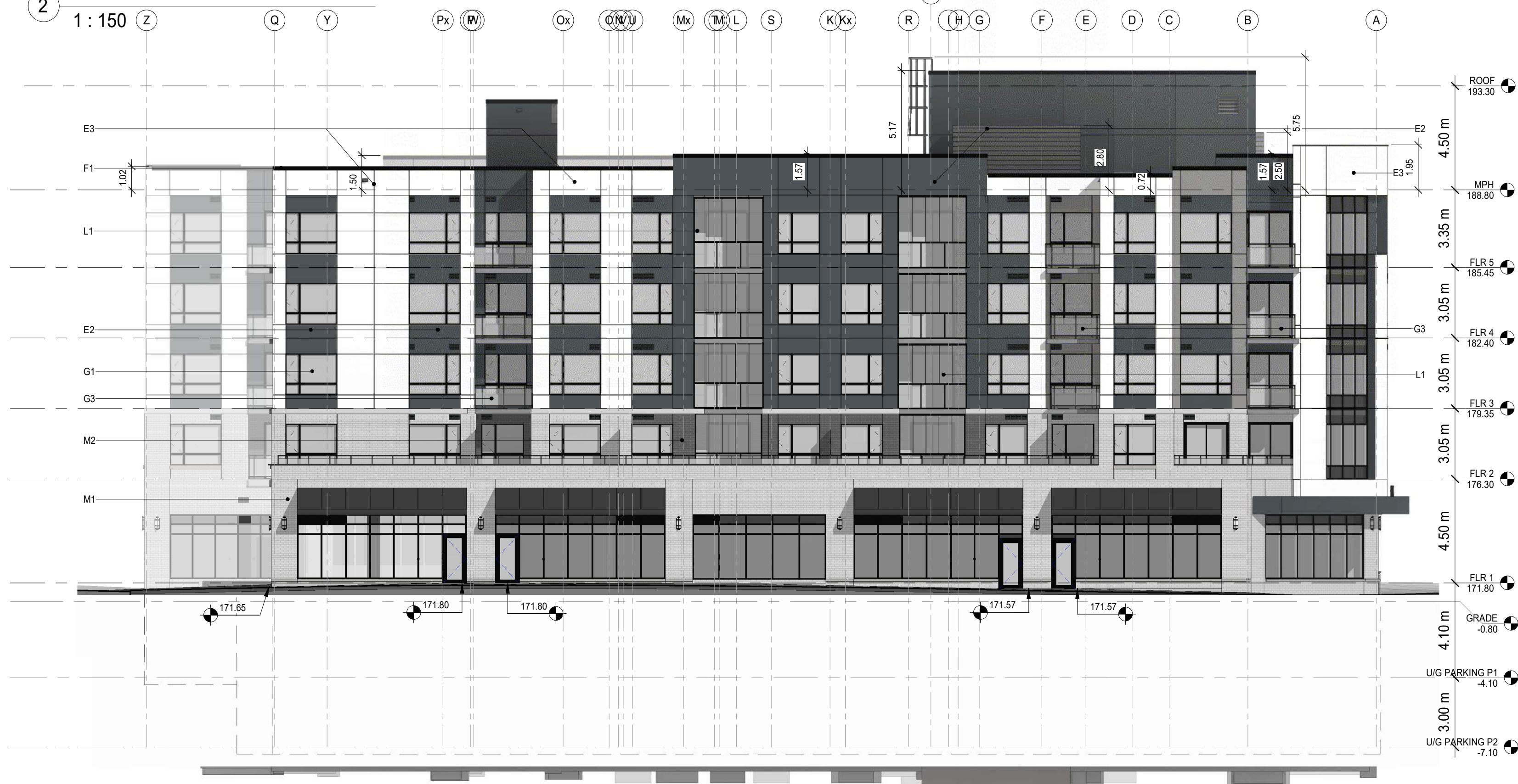
1 SPA - SOUTH ELEVATION