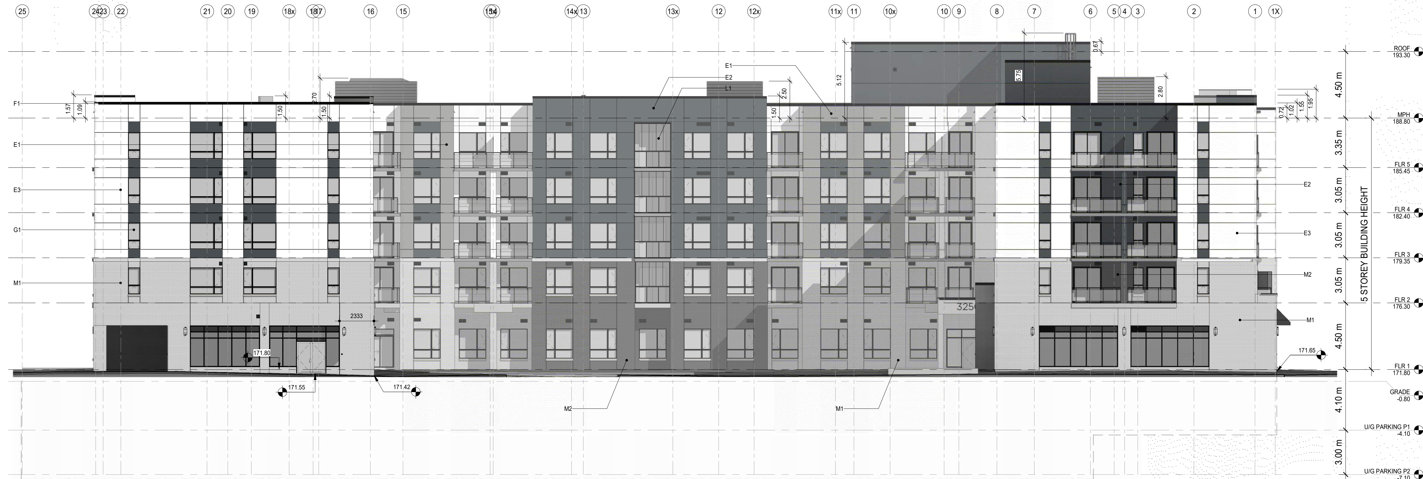
2 SPA - WEST ELEVATION 1 : 150