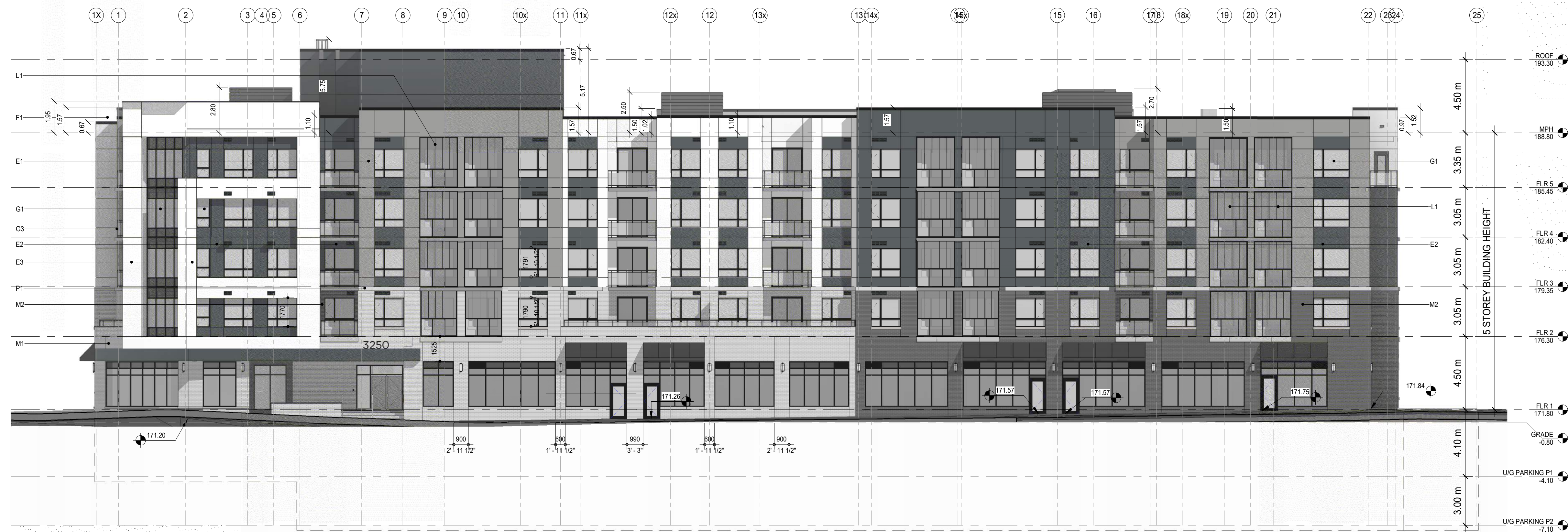
1 SPA - EAST ELEVATION 1 : 150