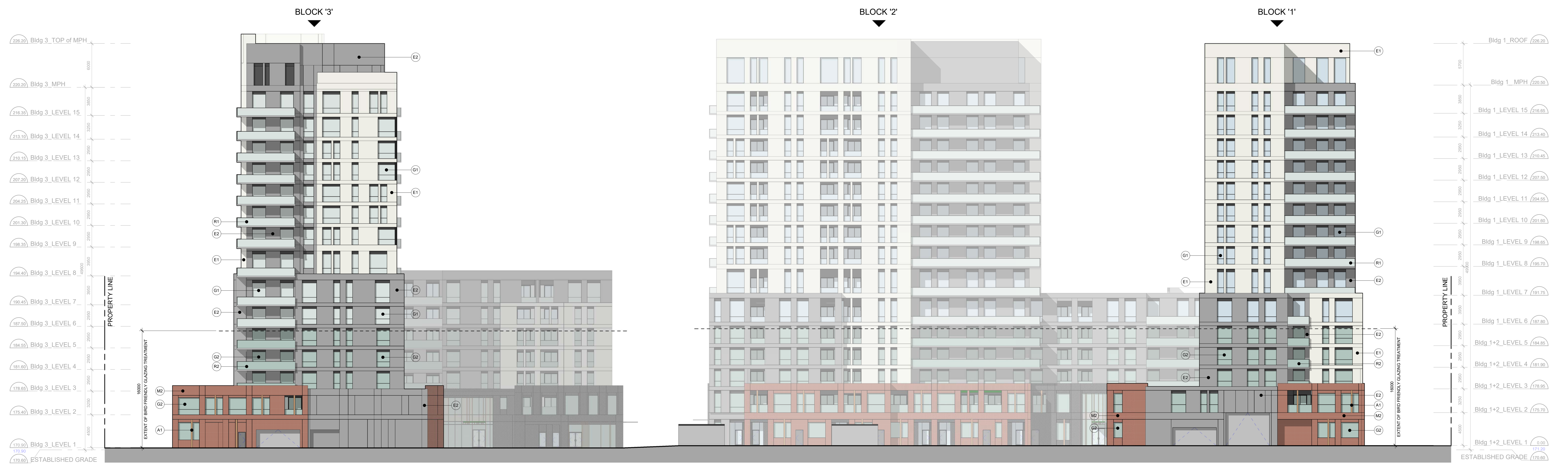
North Elevation 2 1 : 200 dA4.1