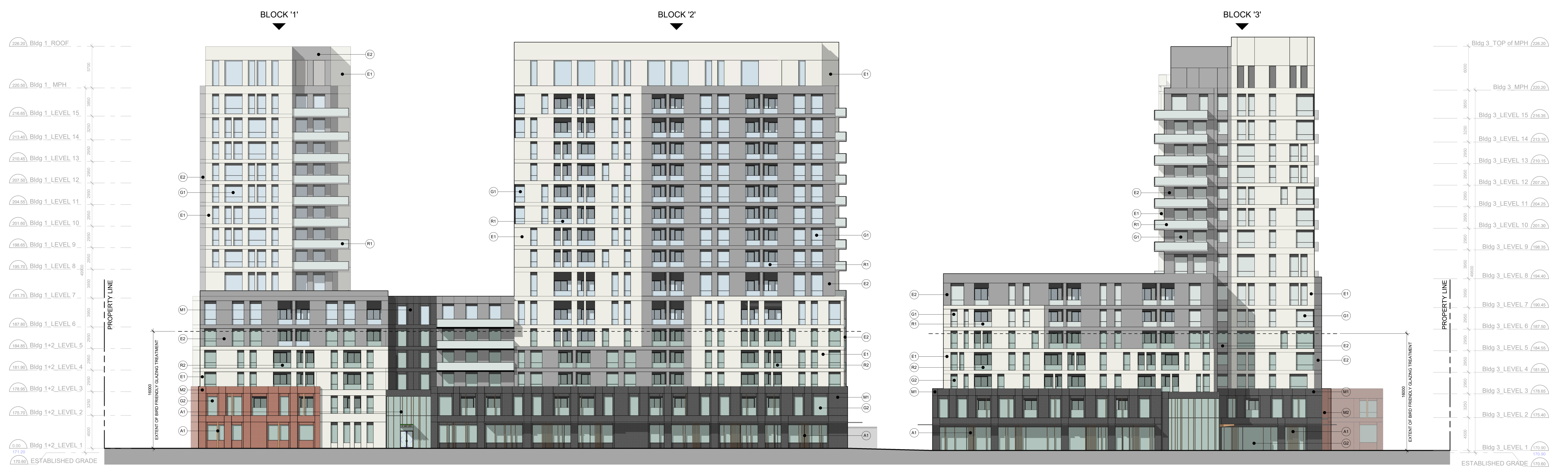
South Elevation 1 1 : 200 dA4.1