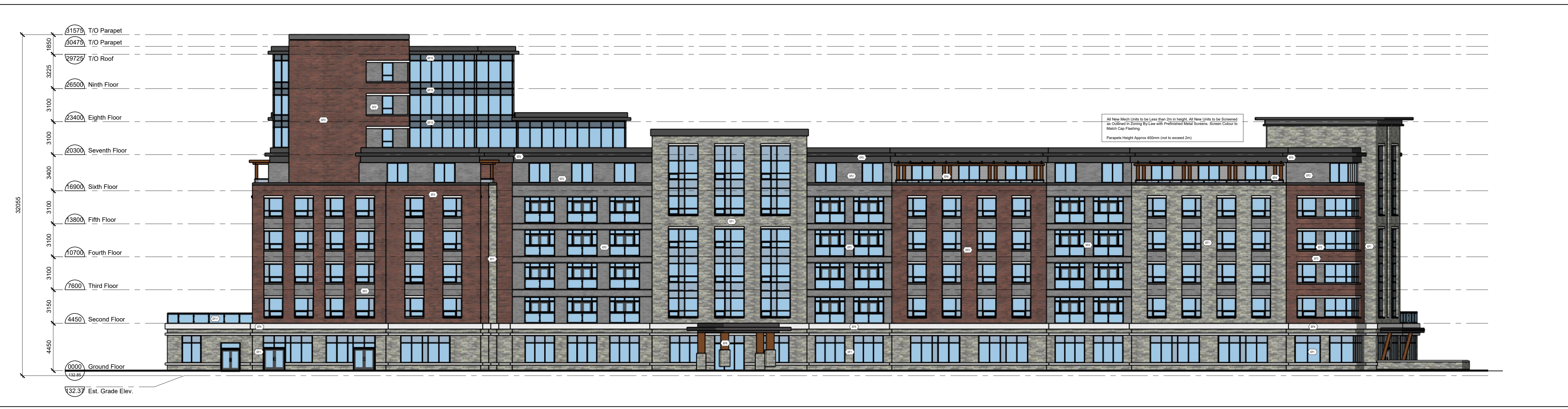
1 West Elevation A201 Scale: 1:200