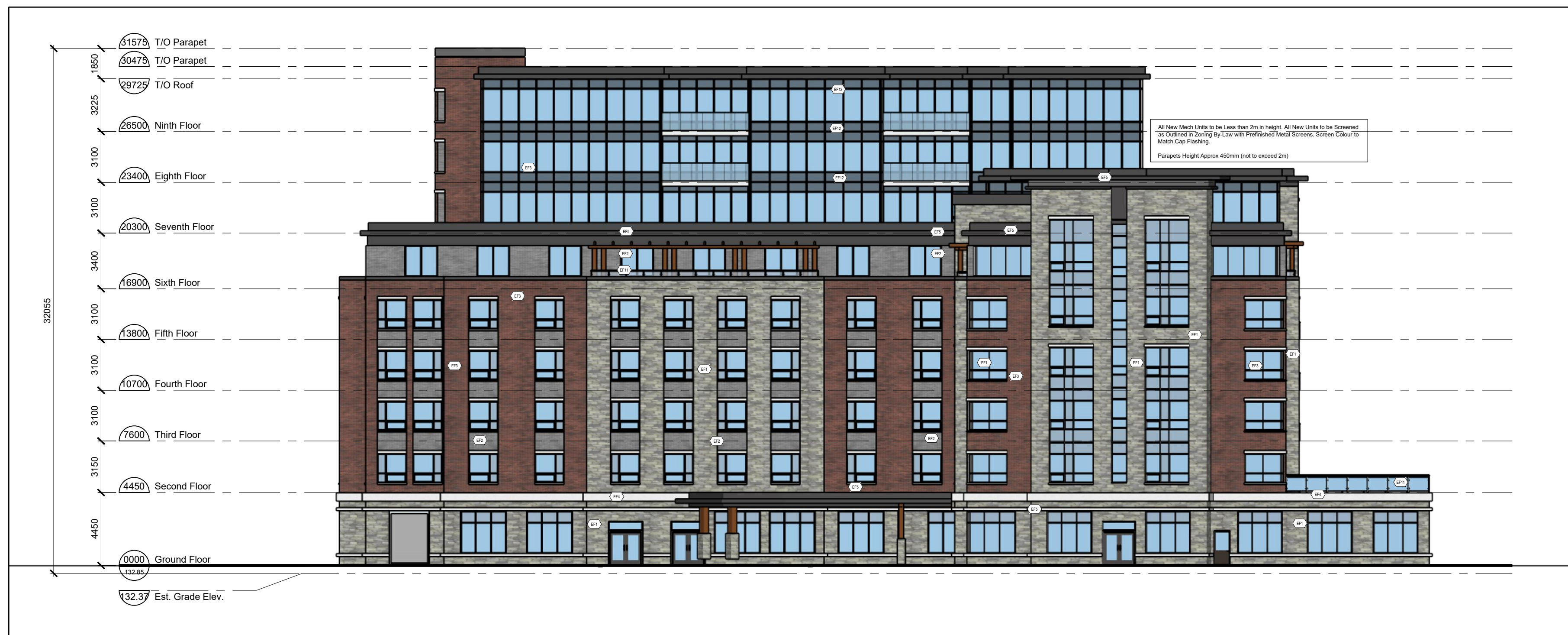
1 South Elevation A202 Scale: 1:200

All New Mech Units to be Less than 2m in height. All New Units to be Screened as Outlined in Zoning By-Law with Prefinished Metal Screens. Screen Colour to Match Cap Flashing. Parapets Height Approx 450mm (not to exceed 2m)