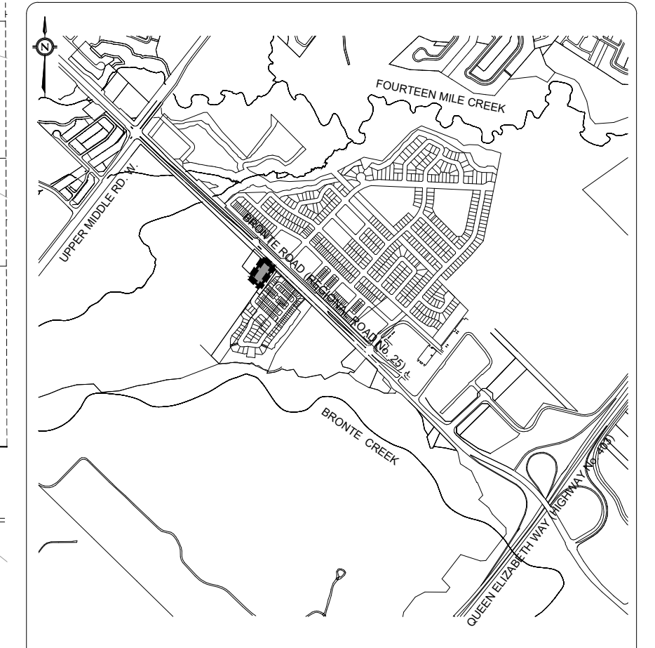
KEY PLAN N.T.S.