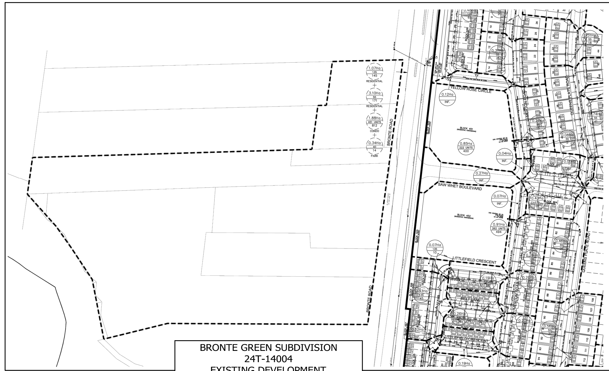
BRONTE GREEN SUBDIVISION 24T-14004 EXISTING DEVELOPMENT PREPARED BY DSEL ENGINEERING LTD. SCALE N.T.S.