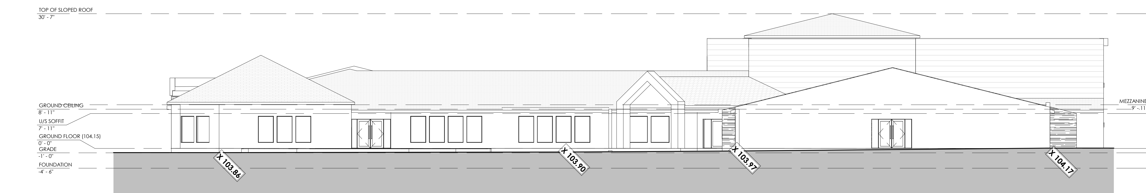
EXISTING RIGHT ELEVATION - FOR REFERENCE ONLY