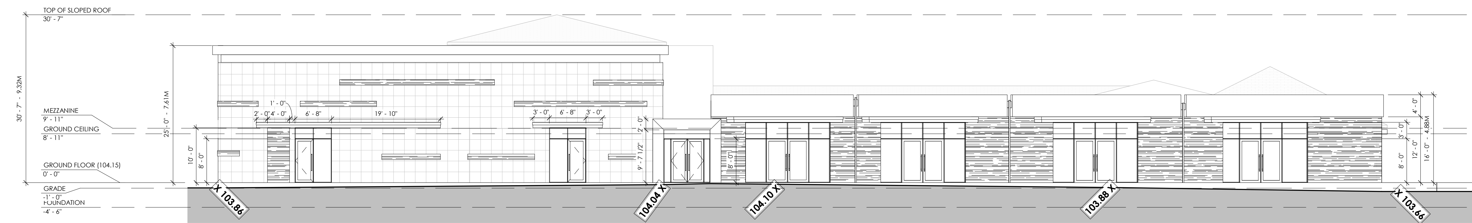
PROPOSED LEFT ELEVATION