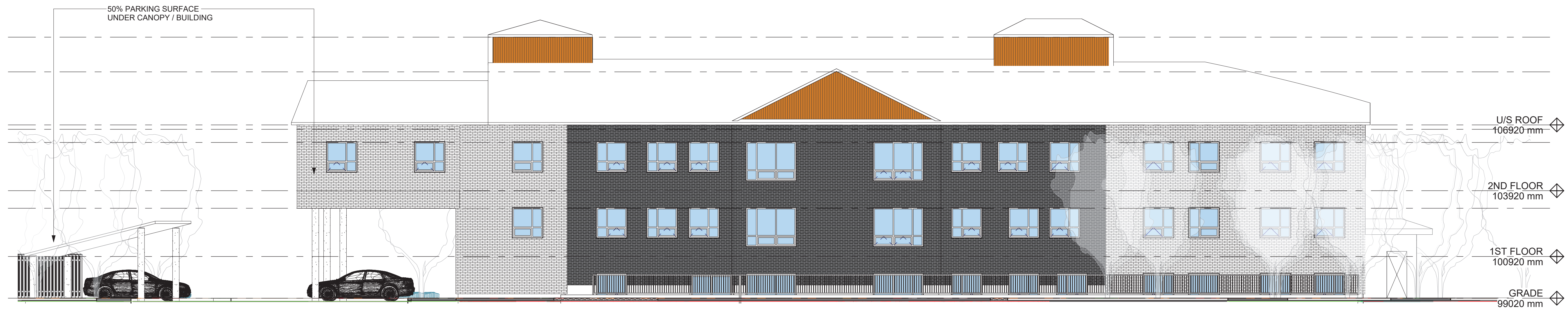
2 SPA - Elevation NORTH 1 : 100