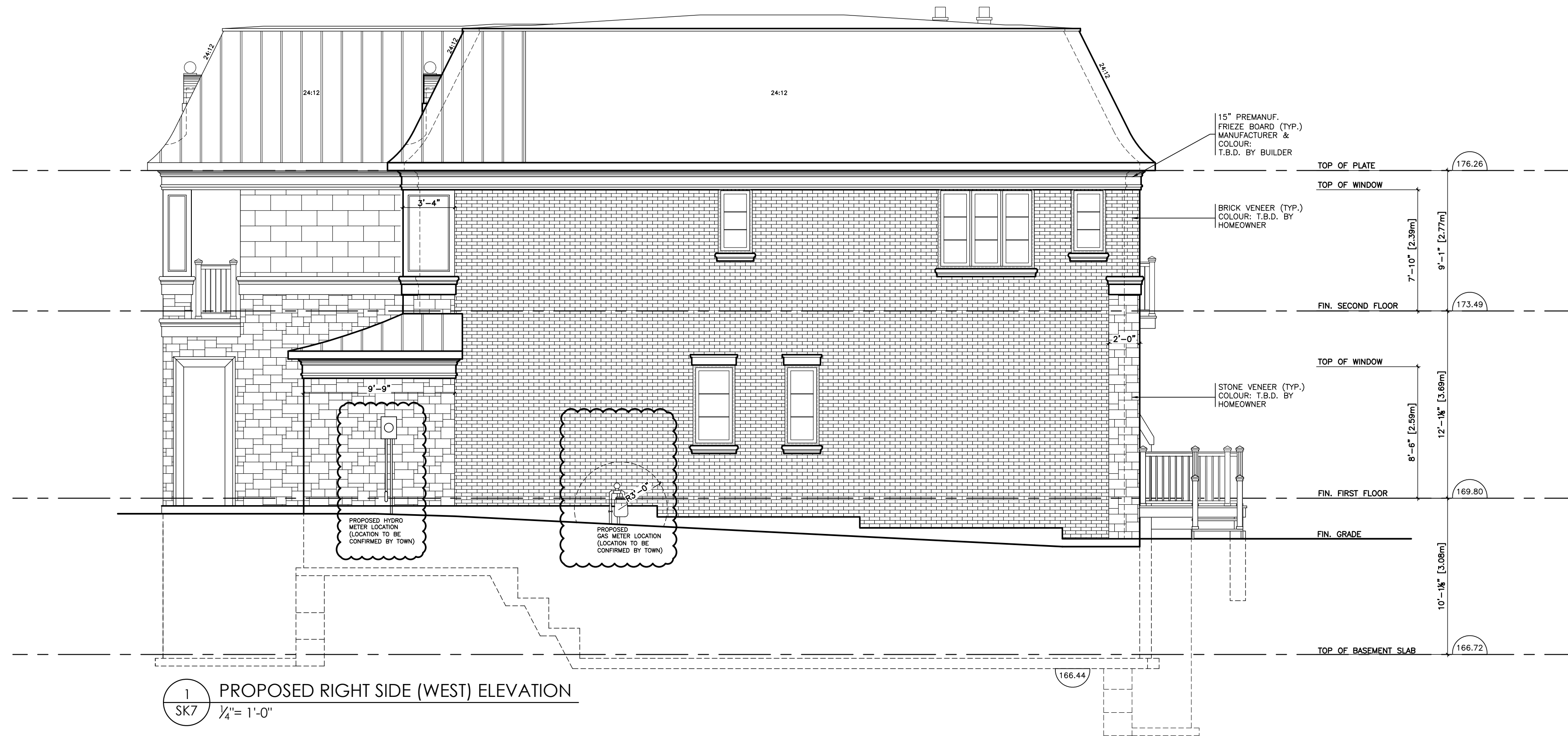
1 PROPOSED RIGHT SIDE (WEST) ELEVATION SK7 1/4" = 1'-0"