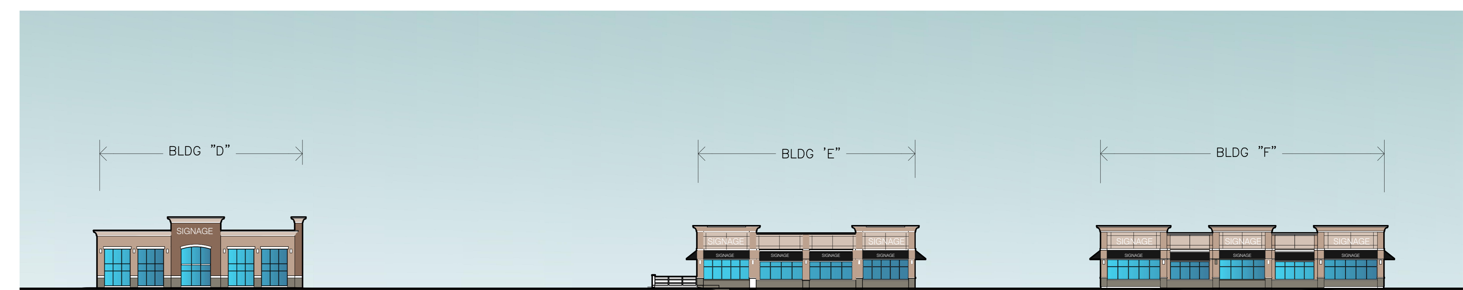
SOUTH ELEVATION, BUILDING D , E & F

XREFS: See HW 1 (Site Plan) [p. 1] FILE NAME: S:\2018\Projects\18142 - Colour Elevations\Colour Elevations\Drawings\18142-02004-ELEVATIONS.dwg DATE PLOTTED: 2021-02-11 1:54:40 PM PLOTTER: HP DesignJet T1100e PLOT SCALE: 1:100 PLOT AREA: 11.00 x 17.00 PLOT ORIGIN: 11.00, 17.00 PLOT DEVICE: HP DesignJet T1100e PLOT MODE: Color PLOT RANGE: All PLOT SHEETS: 3 PLOT SHEET NO.: 3 PLOT SHEET TITLE: COLOUR ELEVATIONS