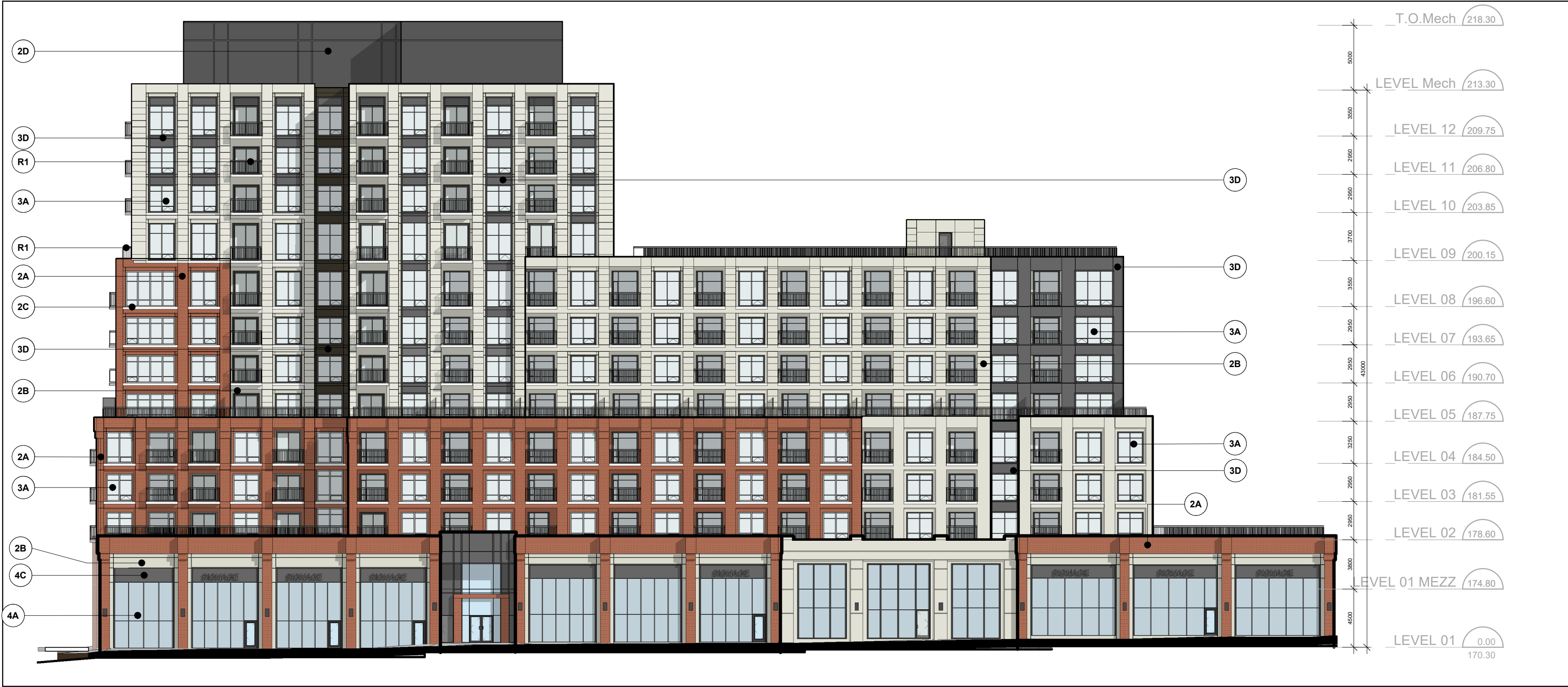
Elevation - East 2 Scale: 1 : 250 A3.1