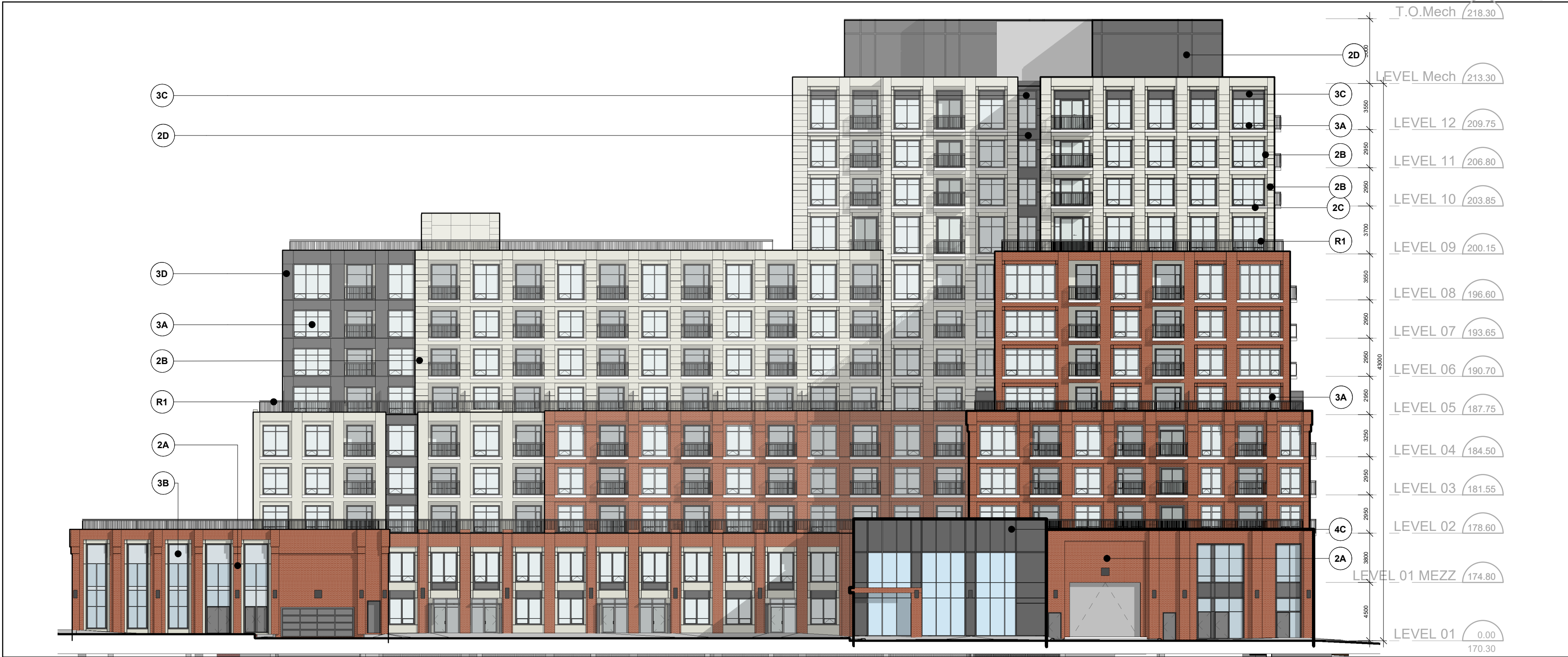
Elevation - West 4 Scale: 1 : 250 A3.1

All Drawings, Specifications, and Related Documents are the Copyright of the Architect. The Architect retains all rights to control all uses of these documents for the intended issuance/use as identified below. Reproduction of these Documents, without permission from the Architect, is strictly prohibited. The Authorities Having Jurisdiction are permitted to use, distribute, and reproduce these drawings for the intended issuance as noted and dated below, however the extended permission to the Authorities Having Jurisdiction in no way debases or limits the Copyright of the Architect, or control of use of these documents by the Architect.