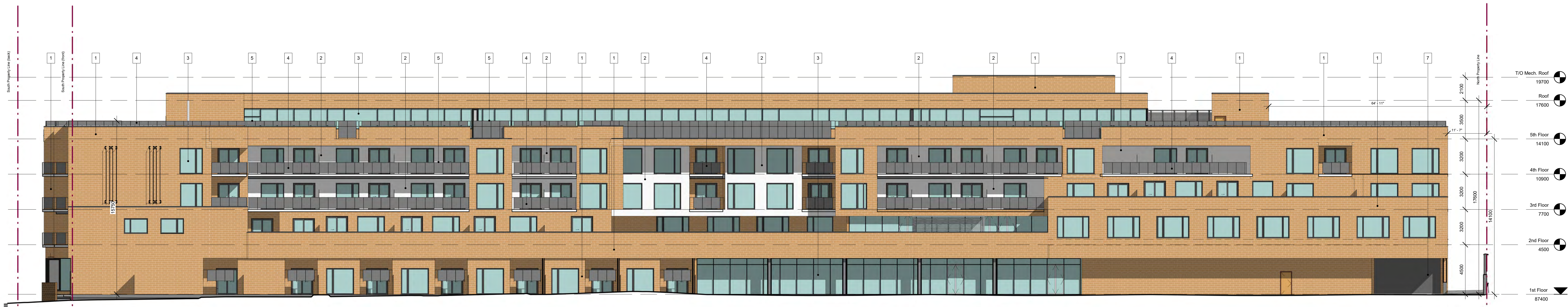
1 East Elevation A0X 1:150