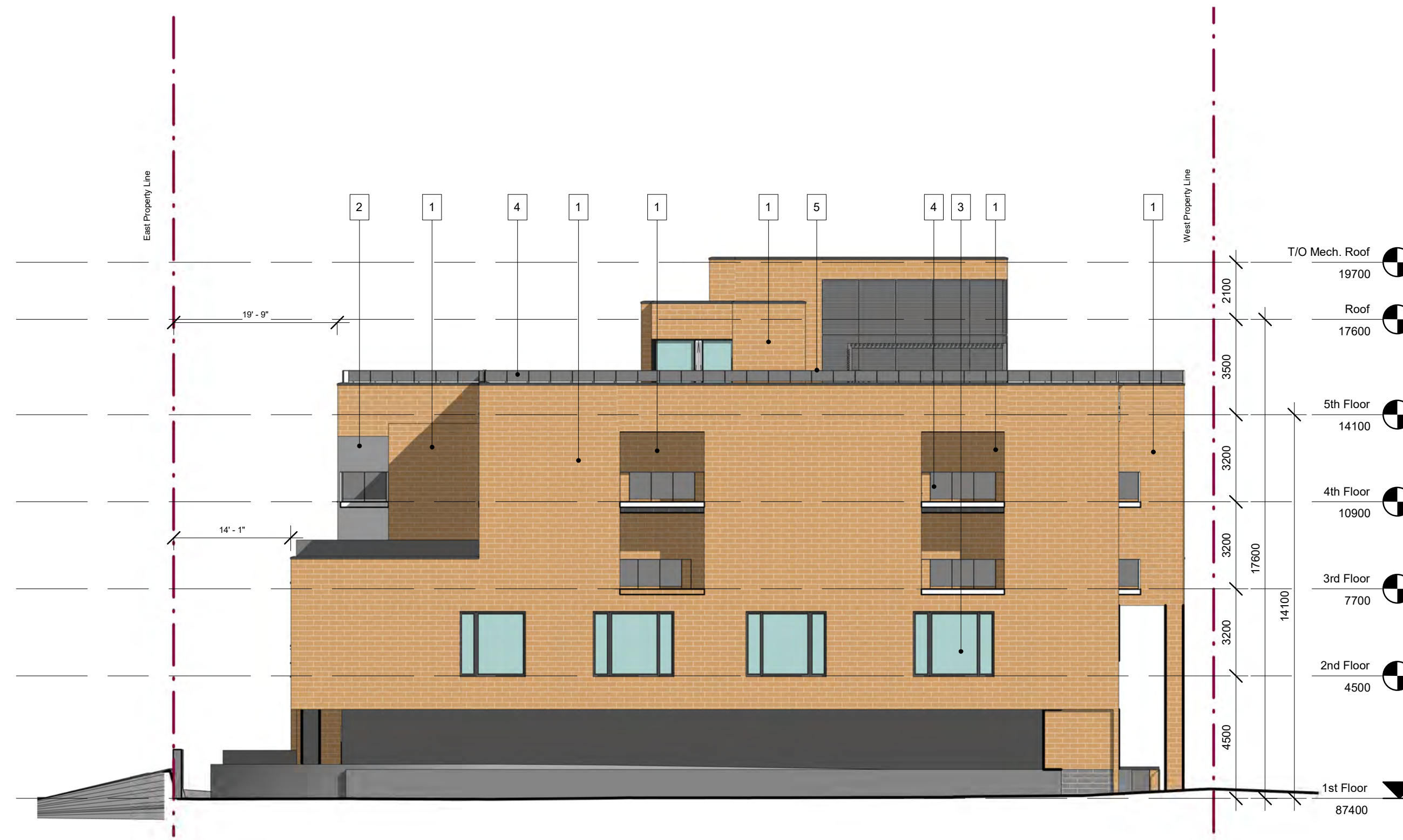
3 North Elevation A0X 1:150