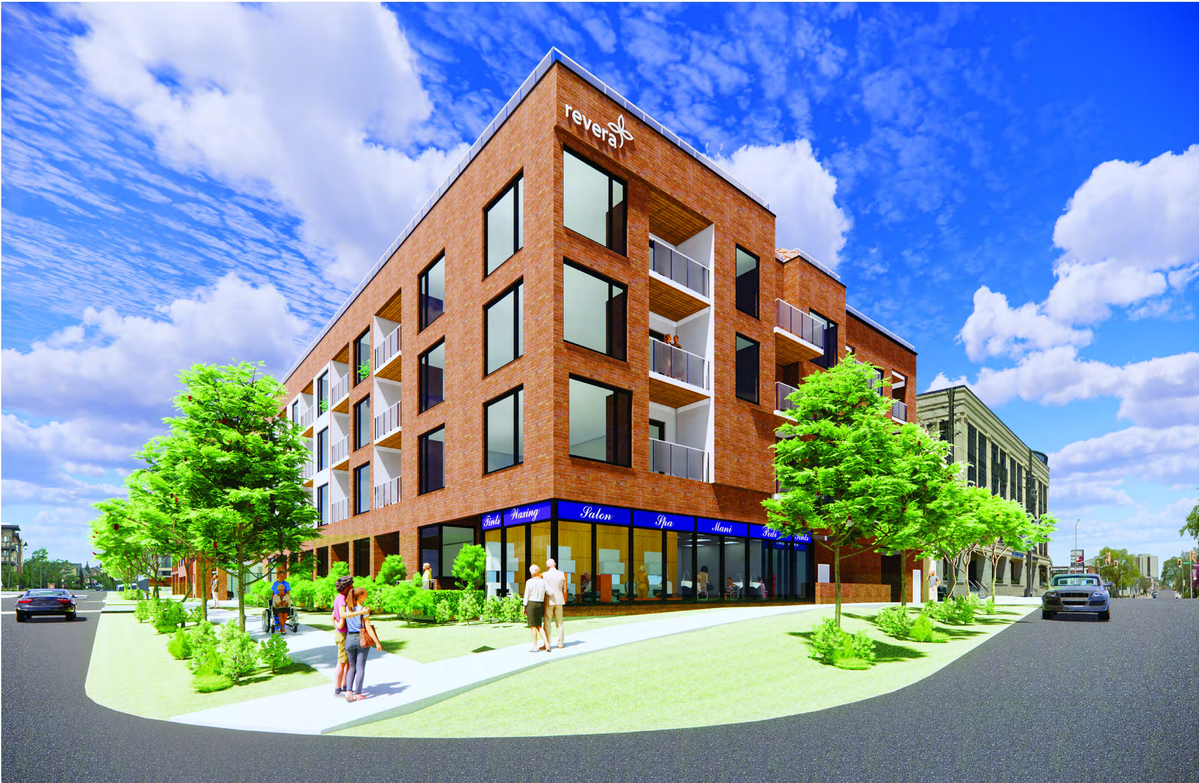
VIEW FROM SOUTH WEST CORNER