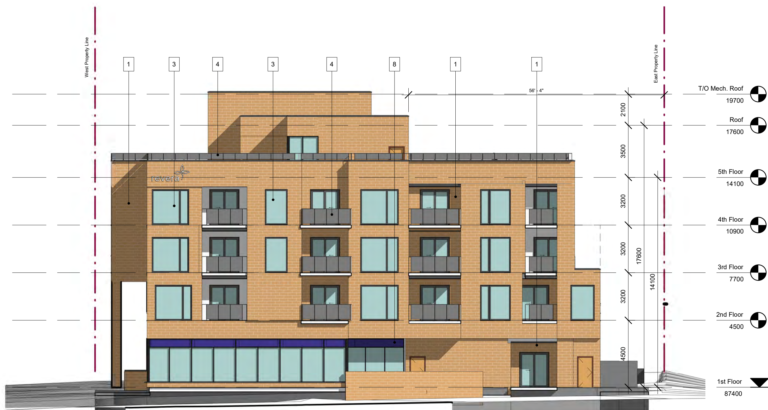
4 South Elevation A0X 1:150