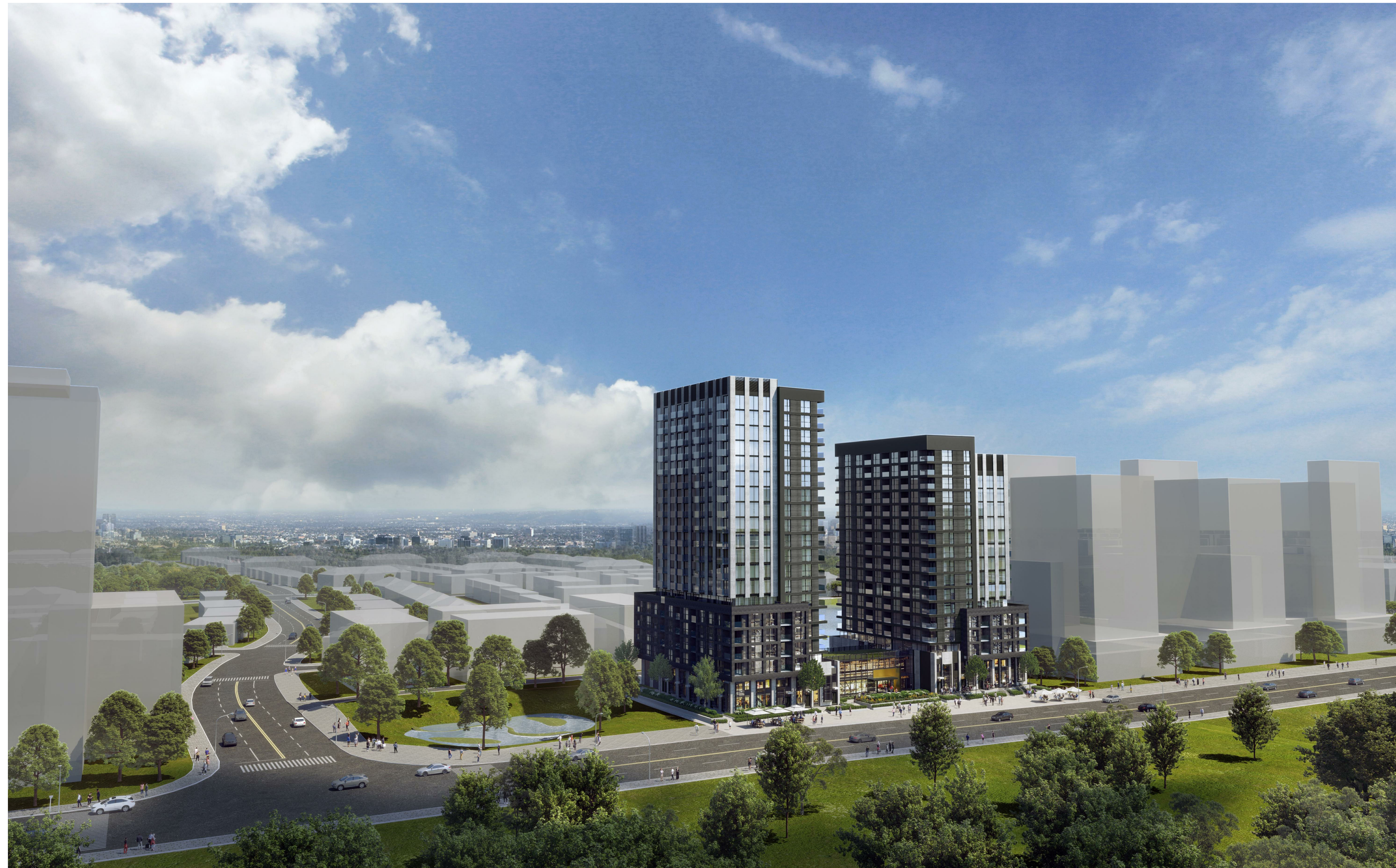
4 NW Corner Render A901.S