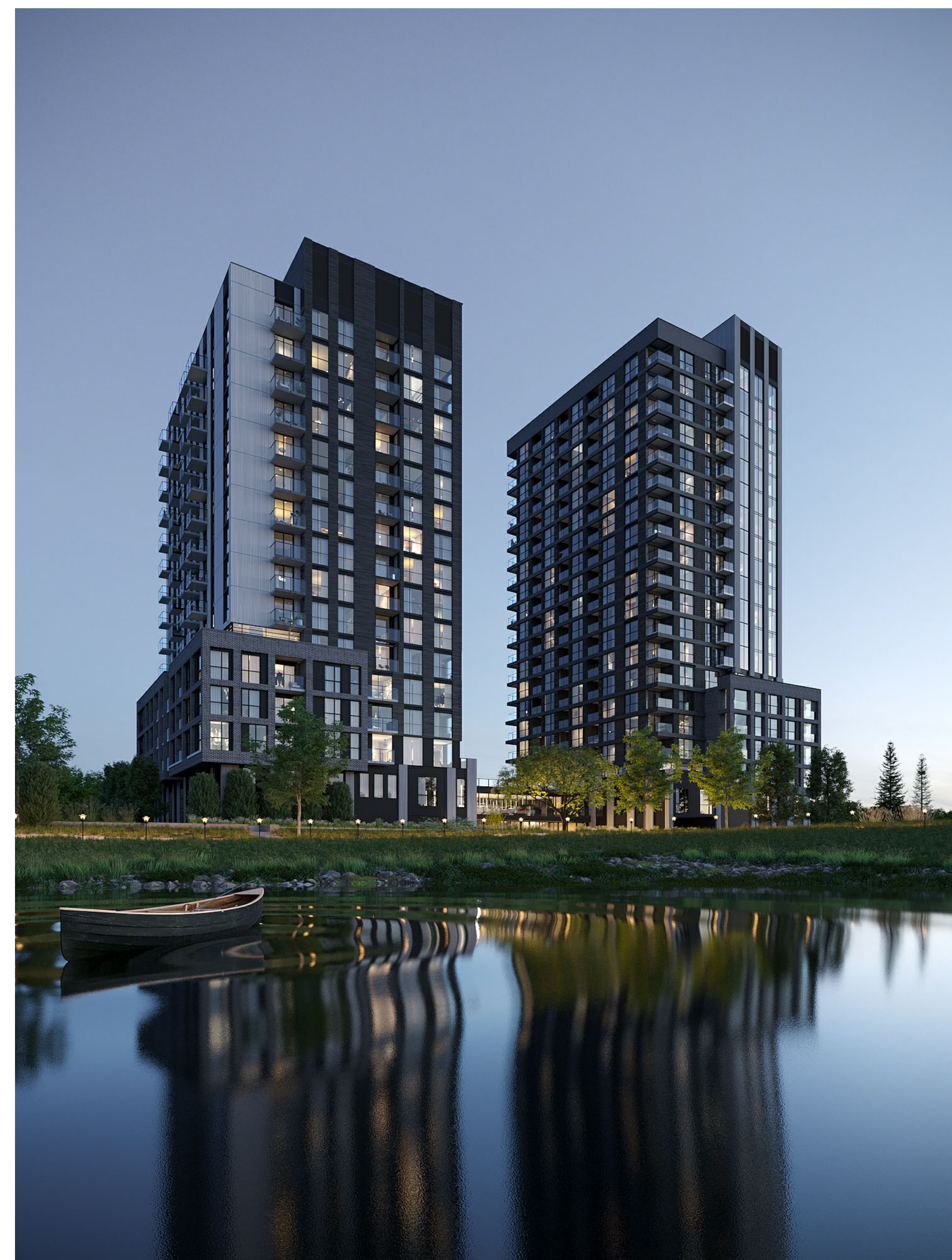
3 SE Corner Render A901.S