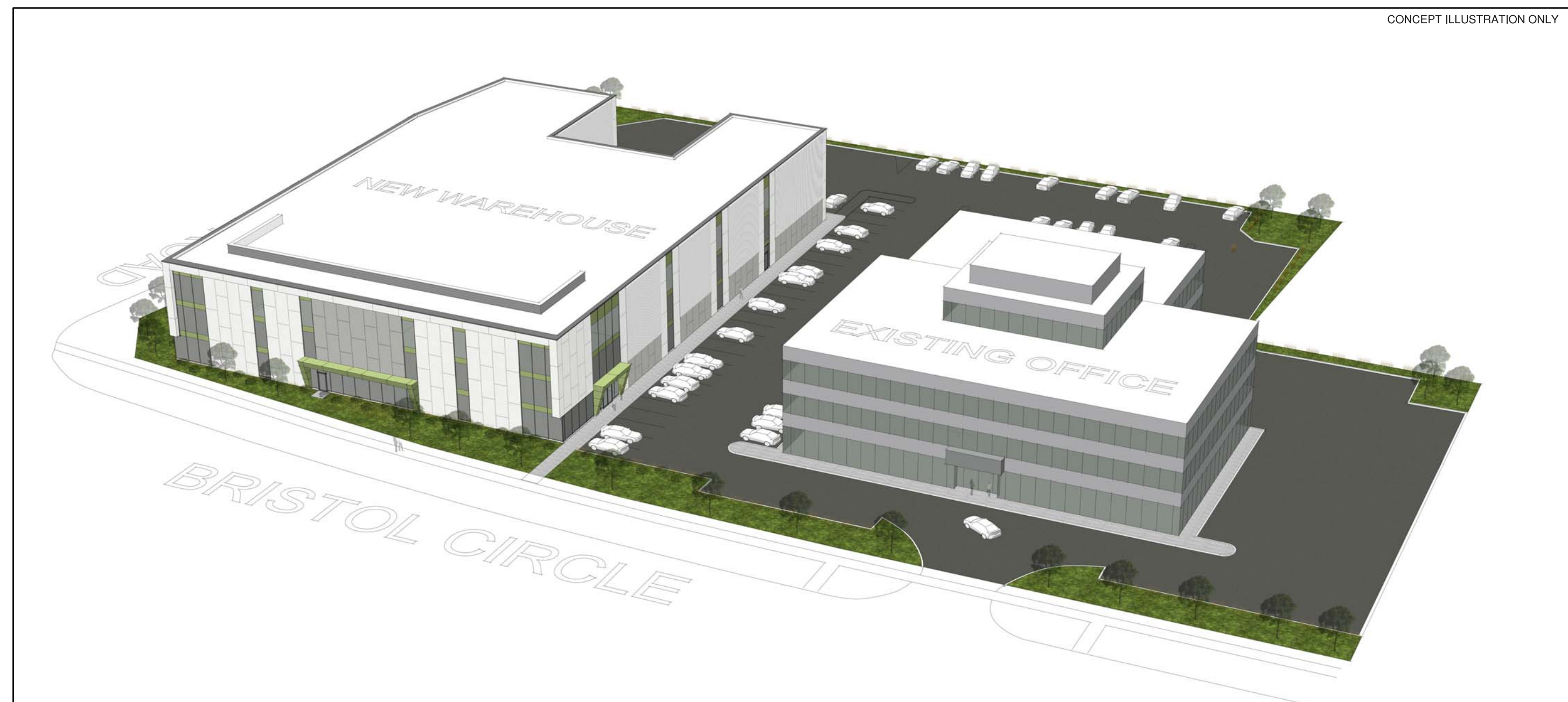
2 BIRD'S EYE VIEW SCALE: NTS