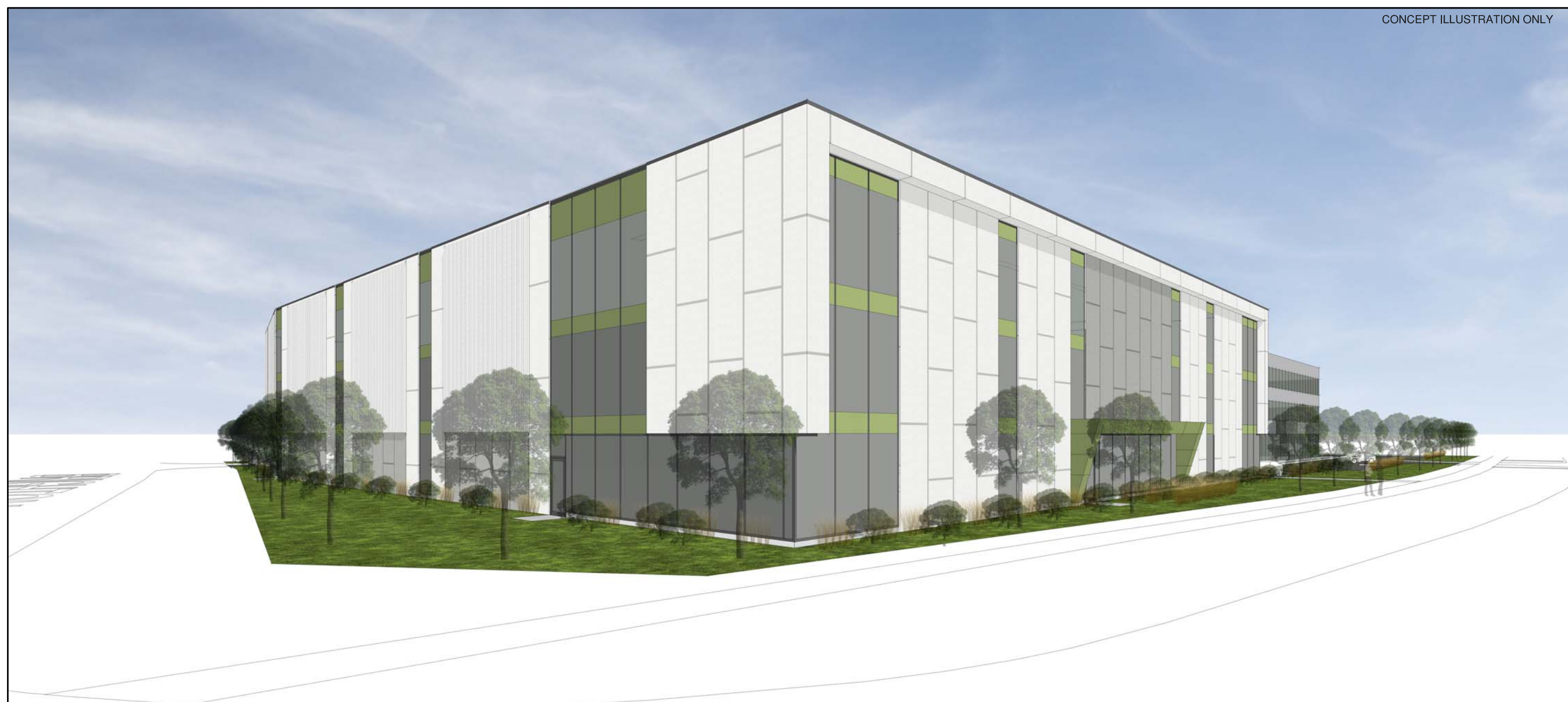
5 STREET PERSPECTIVE VIEW SCALE: NTS