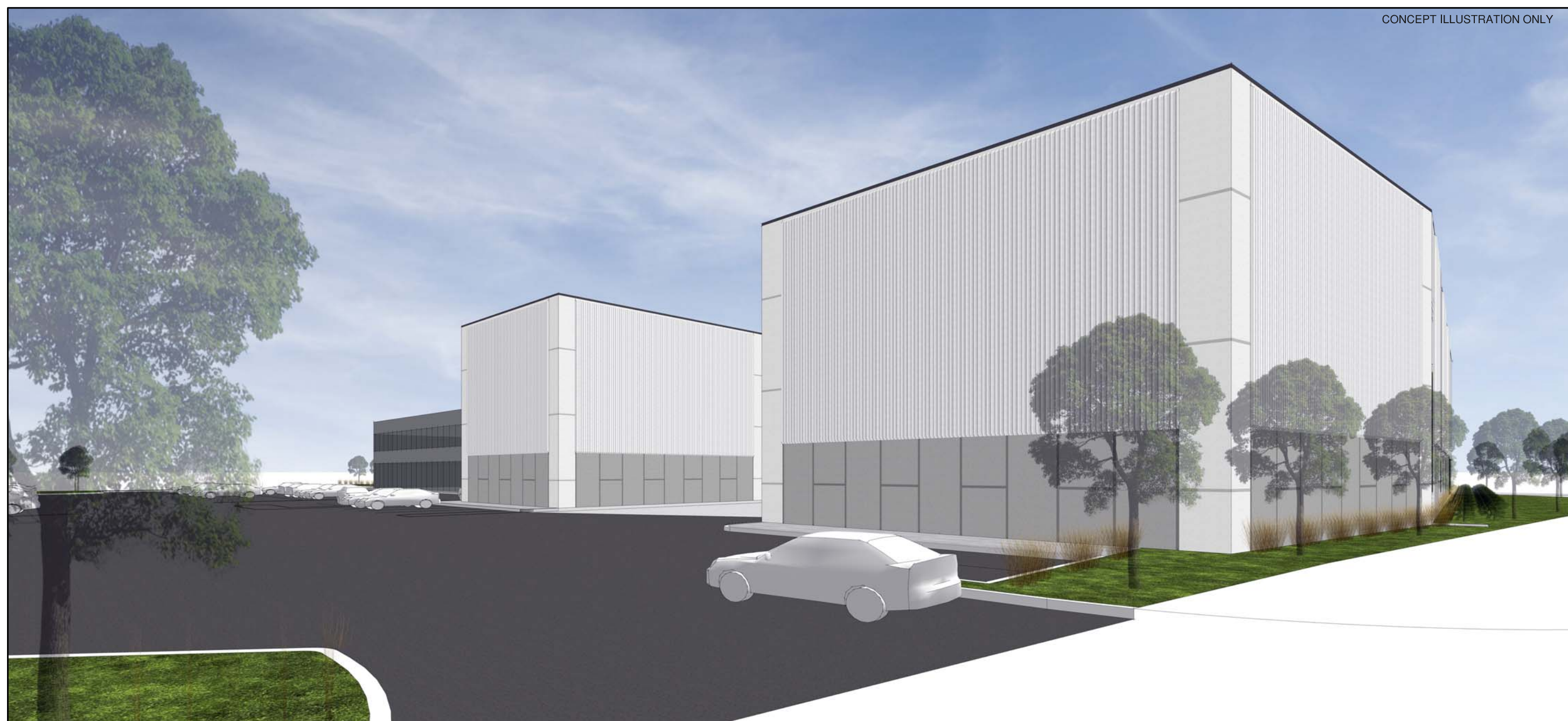
6 STREET PERSPECTIVE VIEW SCALE: NTS