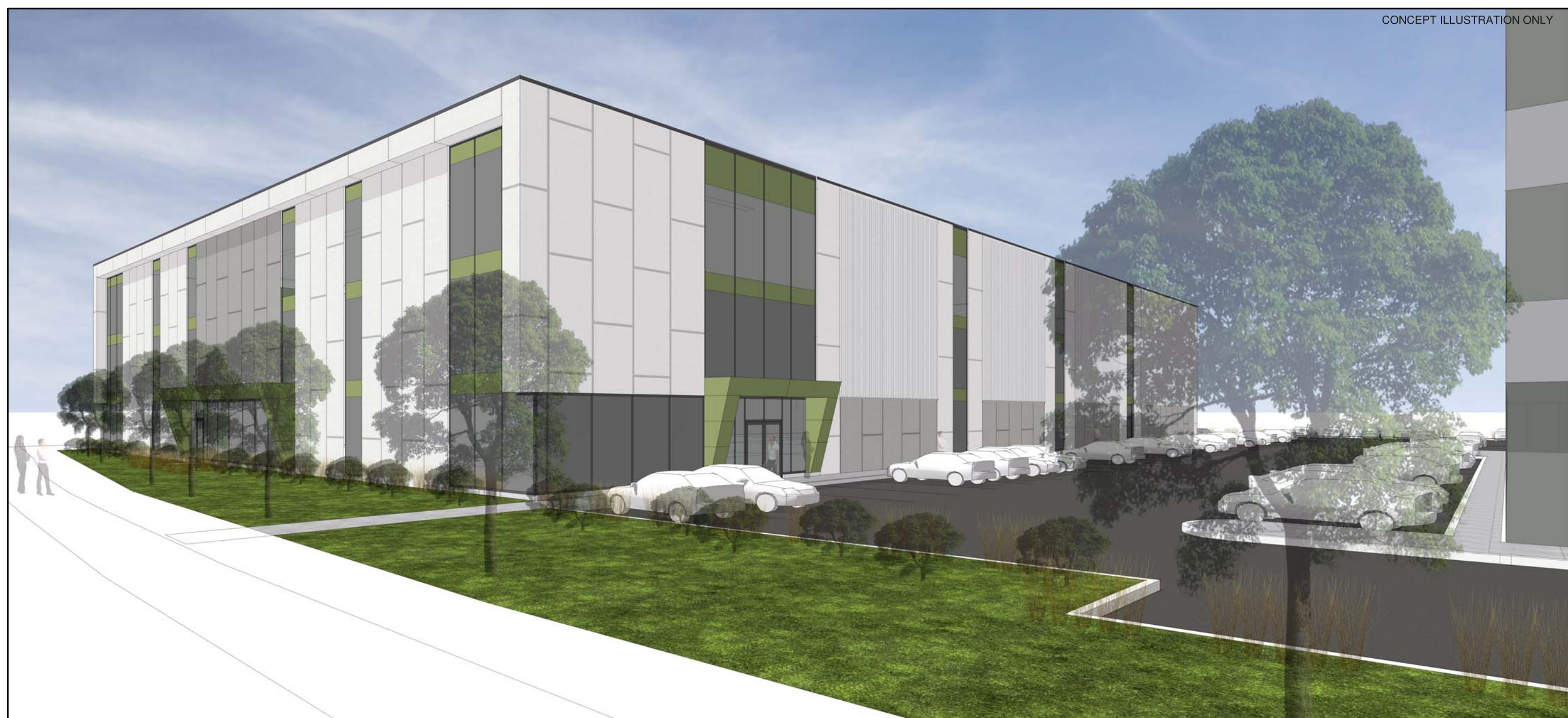
4 STREET PERSPECTIVE VIEW SCALE: NTS